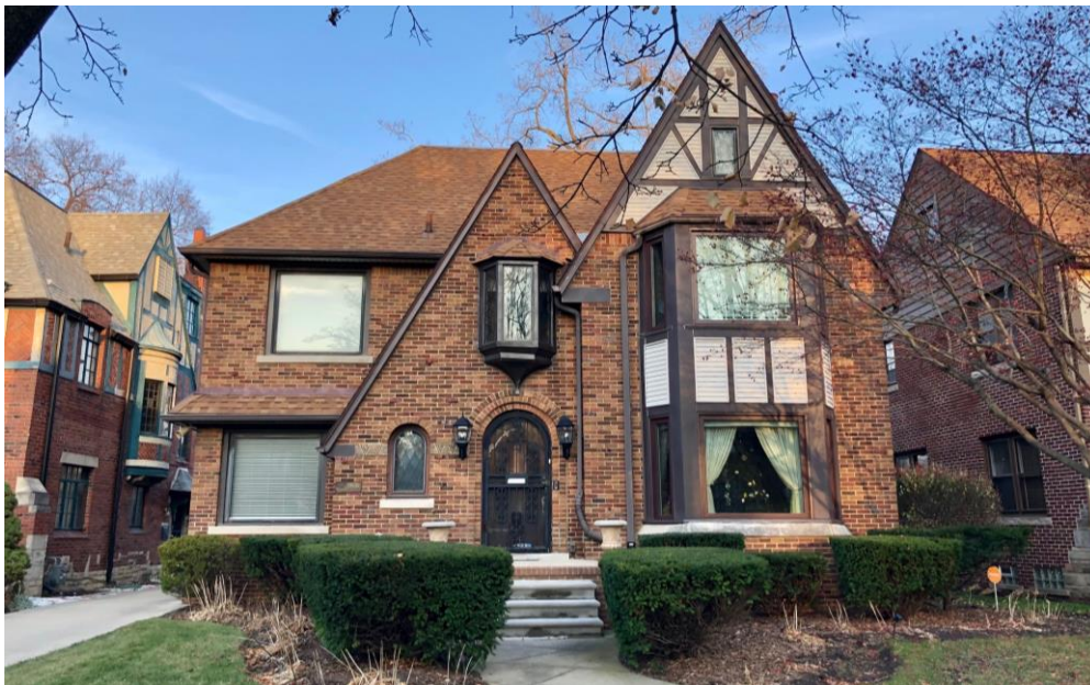
Staff photo, November 29, 2022

The dwelling at 19630 Roslyn was erected in 1926. The house offers Tudor revival styling through the steeply pitched roof, asymmetrical front elevation with multiple front-facing gables, an oriel window, and arched front entry with flanking small arched window. Vinyl siding fills wall surfaces on each elevation; the pattern gives reference to possibly covered half-timber and stucco cladding.