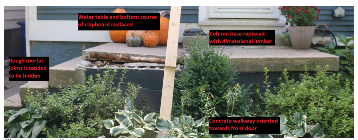
Illustration by staff.

• Further, staff was able to determine, with a reasonable degree of certainty, the configuration of the original or historic porch. Several clues, including the use of rougher brick on the left (south) end of the foundation contrasted with textured brick on the right (north) end, the use of newer dimensional lumber to infill areas where original porch elements formerly existed, and the orientation of a concrete walkway with respect to the front entrance, suggest that the building once possessed a wood porch very close to what the applicant has proposed.