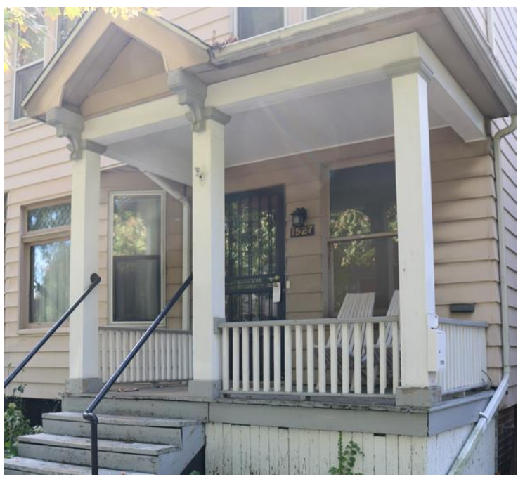
Neighboring porch at 1527 Parker.