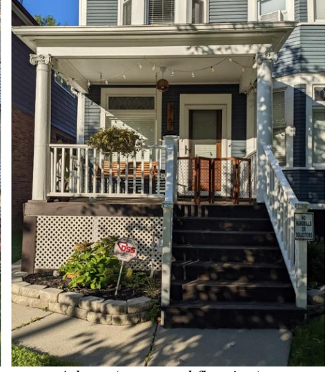
Comparable wood porches in the vicinity; note that they are defined by three major elements: A base (stoop and flooring), a middle (composed of support columns), and a top (a full-width roof which crowns the composition).