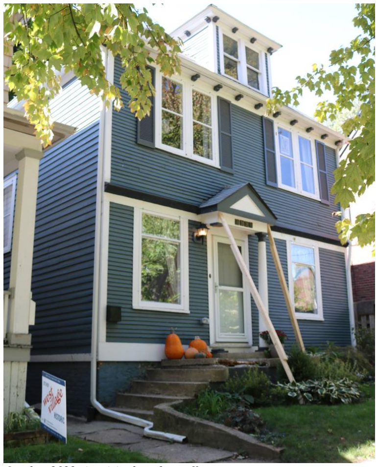
October 2022 site visit photo by staff.

The house at 1531 Parker is a two-and-one-half-story foursquare house built in 1925. It faces east onto the street; like many houses in West Village and especially on Parker Street, it has a shallow setback from the public right-of-way. The front porch, subject of this application, features a short concrete deck with steps oriented perpendicular to the main entrance. A short portico consists of a Classical pediment projecting only about two feet from the façade, separated by columns. One of these columns became detached in September 2022 and was removed by the owner. Physical and documentary evidence strongly suggests the porch was reconfigured during the mid- to late twentieth century, as described under Staff Observations and Research, below.