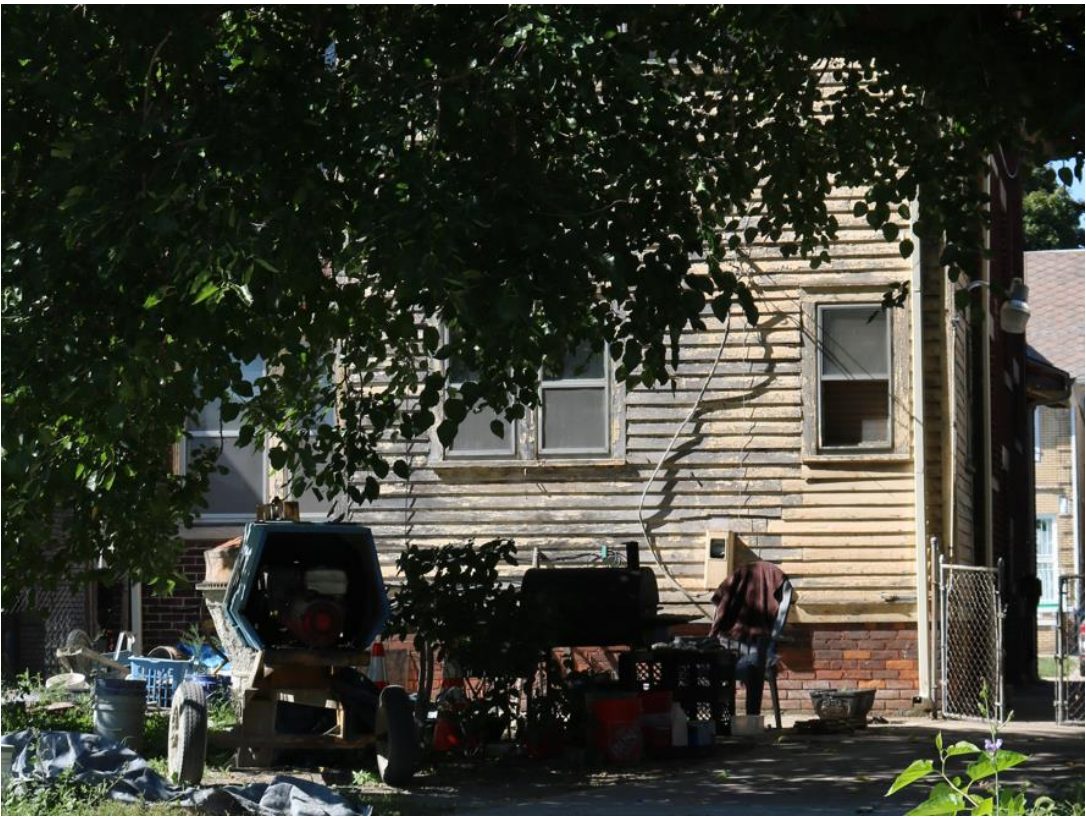
Rear (south elevation) of building. September 2022 photo by staff.

• Staff suggests that the existing windows proposed for replacement are historic; this opinion is based in the building's age and architectural style as well as the inclusion of wood sash windows in the Elements of Design.