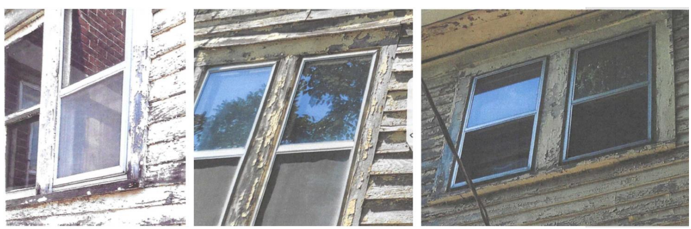
Left west elevation windows; Center: first floor windows; Right: second floor windows. Photos from application.

The proposed new windows are Hanson's "traditional" vinyl windows in white. The windows on the first and second floor would be double-hung sash windows. According to the proposal, the attic window configuration would be changed, with each pair of sash windows replaced with a single, sliding window. Neither the application nor the Hanson's website provides detailed specifications regarding the dimensions of the proposed windows.