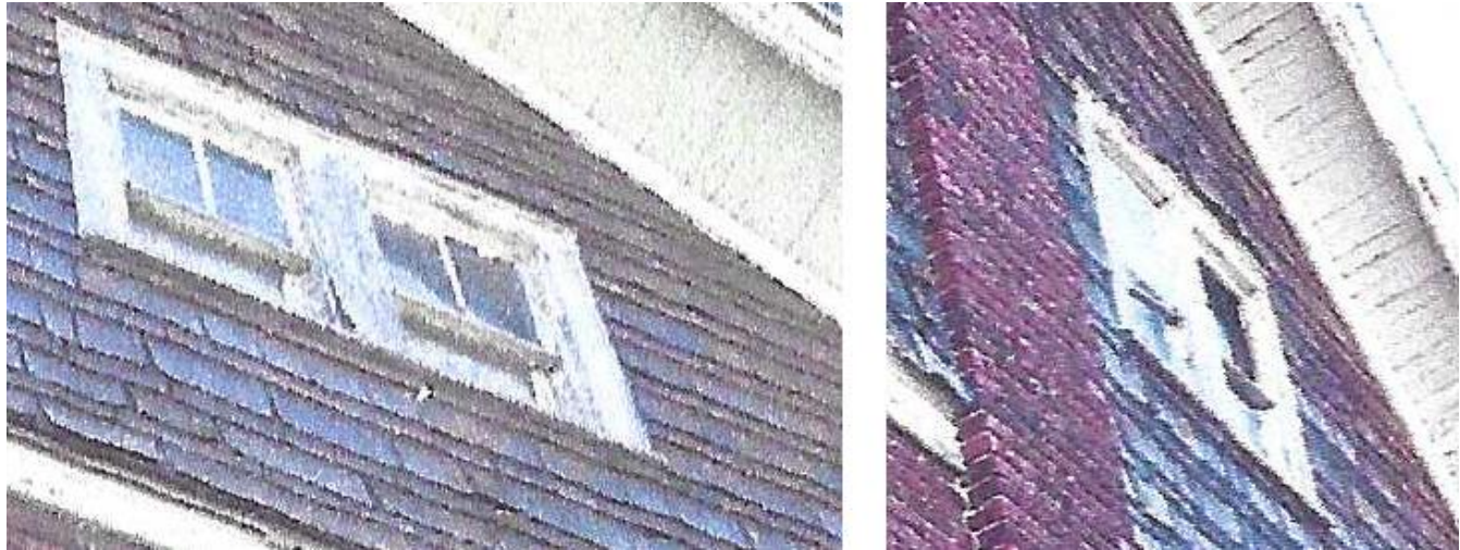
Attic windows proposed for replacement. Left: west elevation; Right: east elevation. Photos from application.