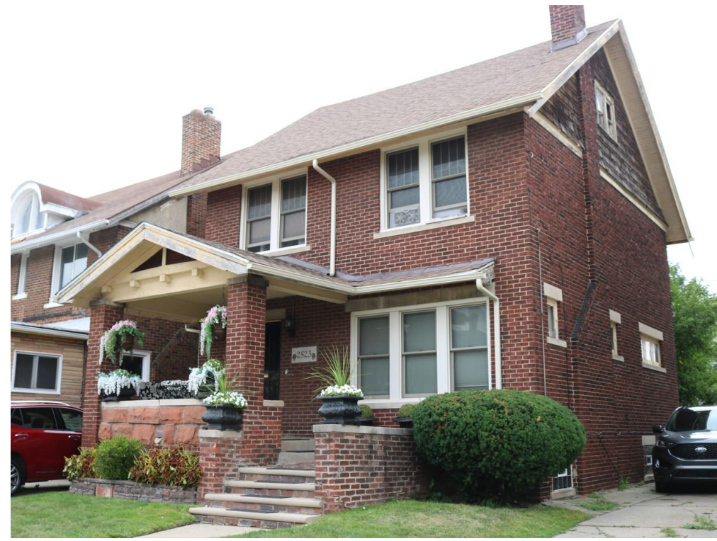
August 2022

2623 Atkinson Ave. is a two-and-a-half story, red brick, side-gabled house built in 1919. It faces north to Atkinson Avenue in the Atkinson Avenue Historic District. The house is comparable to the other houses in the district in overall massing, and distinguishes itself with a subtle Arts and Crafts influence, particularly evident in a projecting front porch that exhibits wide vergeboards and projecting brackets. A projecting rear ell, clad in clapboard siding, is potentially a later addition to the building. The home contains a mix of wood windows and fiberglass or vinyl replacement windows.