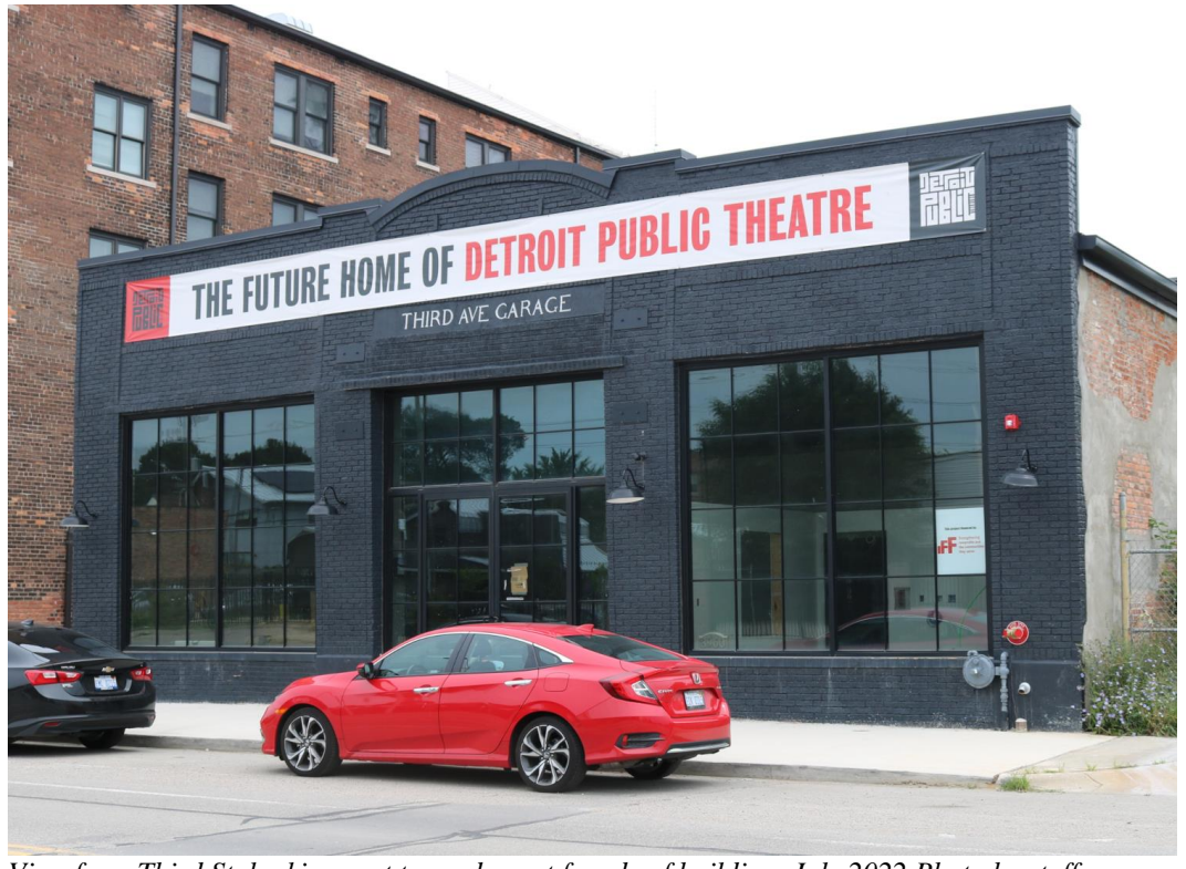
View from Third St. looking east towards west façade of building. July 2022

The building at 3960 Third Street is a one-story, three-bay garage built in 1927. It is constructed of concrete block with a brick parapet front with limestone detail. A 2020 façade rehabilitation includes the addition of glass fenestration in bays that formerly contained brick or a roll-down steel door, and the addition of swan-neck light fixtures between each bay. The business sign in the photo below, reading "THE FUTURE HOME OF DETROIT PUBLIC THEATRE" is a temporary vinyl banner. An engraved "THIRD AVENUE GARAGE" heritage sign of engraved limestone, centered on the facade with letters painted white, indicates the apparent original occupant of the building.