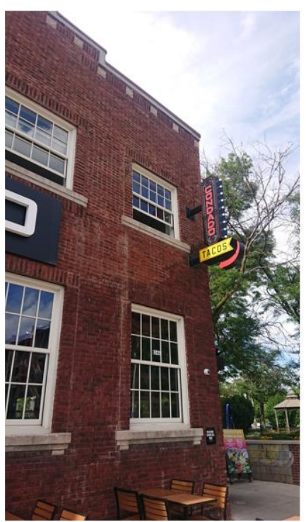
Comparable projecting signs in Willis-Selden. Left: Historic. Center and Right: Certificate of Appropriateness.