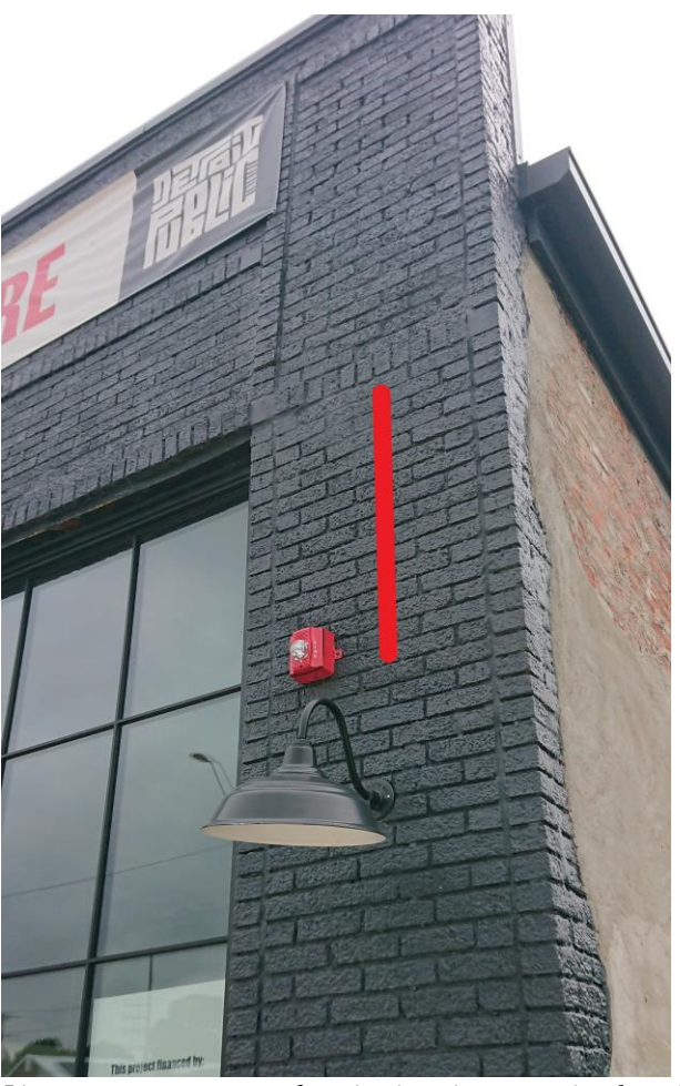
Line represents proposed projecting sign mounting location. Illustration by staff.

• The proposed projecting sign location is in close proximity to a fire alarm strobe which has already been installed, and a swan-neck light fixture which also presently exists on the façade. This condition is not clearly indicated in renderings provided by the applicant.