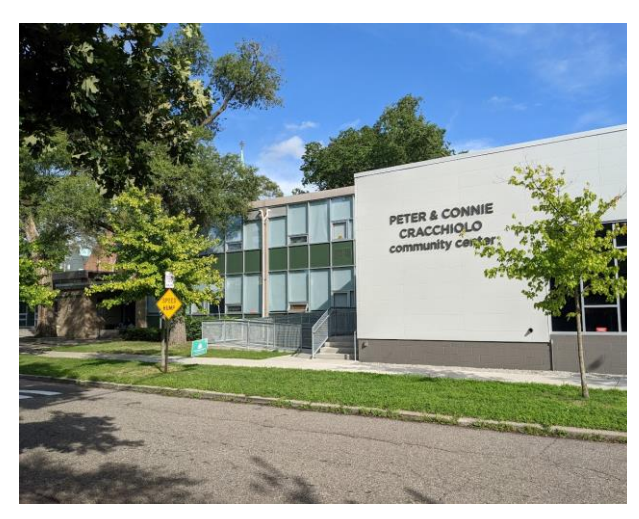
Current conditions, existing signage, staff photos taken 7/27/2022

• If the proposed new signage is installed a total of nine signs will exist at the building (at the north and east elevations). However, due to the building's large scale, the location of the four new signs (they will be be grouped in two locations: the main/6<sup>th</sup> Street entrance and the north elevation entrance), and the type of new signage (unilluminated, small scale, panel signage and adhesive letters), the proposed installation will not overwhelm the building. Staff therefore Although five signs are currently extant at the building, its large scale. It is staff's opinion that the proposed new signage is appropriate and will not detract from the building's historic character.