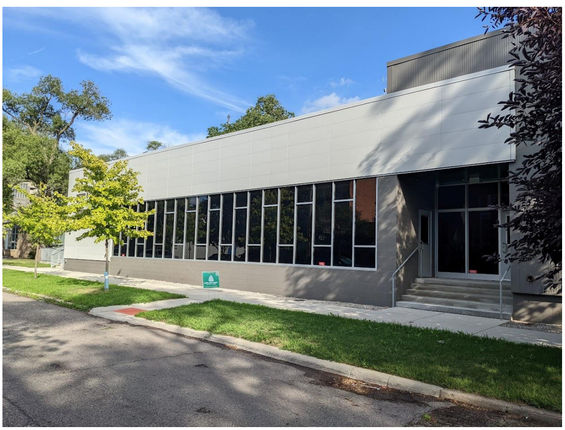
1221 Labrosse, current conditions, 7/27/2022 staff photos