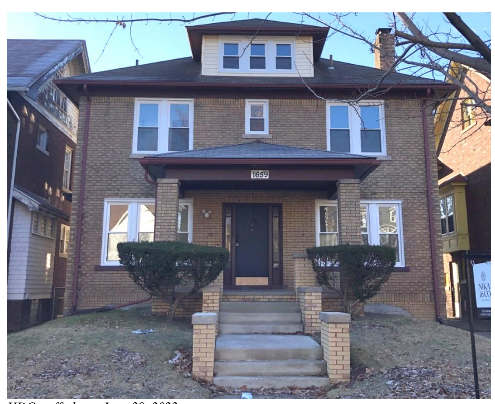
June 29, 2022

Constructed circa 1916, the house at 1659 Longfellow sits mid-block on the south side of the street. A stepped front walk, flanked by short brick piers at each set of steps, bisects the front yard and leads to a covered front porch, which is supported by full-height brick piers. The centrally placed front door is balanced by a large window opening at each side, while smaller mulled window openings and a small, centrally placed single window create a similar three-part pattern at the second floor. The raised porch, stepped-in second floor windows and the porch's hip roof, lead the eye upward to the centrally placed dormer and three-part window opening. The ribbons of windows, wide fascia, overhanging boxed eaves and unadorned yellowish-brown brick, create a vernacular Prairie style expression to the house. Due to narrow lots, there are only a few feet between the house and its eastern neighbor, but a shared driveway offers a few extra feet between the house and its neighbor to the west. The property features a hipped main roof with four, hipped-roof dormers. Cream-colored vinyl siding and white vinyl windows have been added to each of the four dormers.