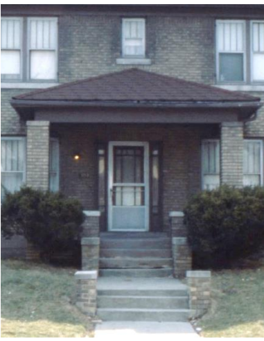
Front porch steps/piers, 1980