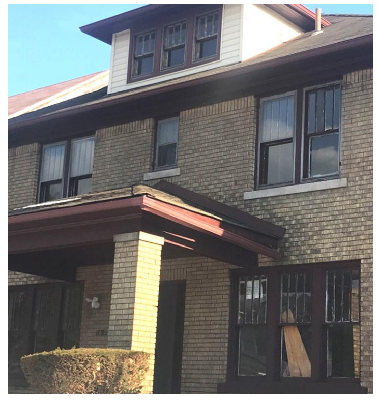
Above: HDC staff photo, February 2021 Below: HDC staff photo, March 2022