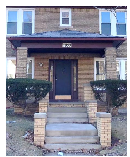
Front porch steps/piers, current appearance