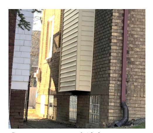
Current appearance of side bumpout