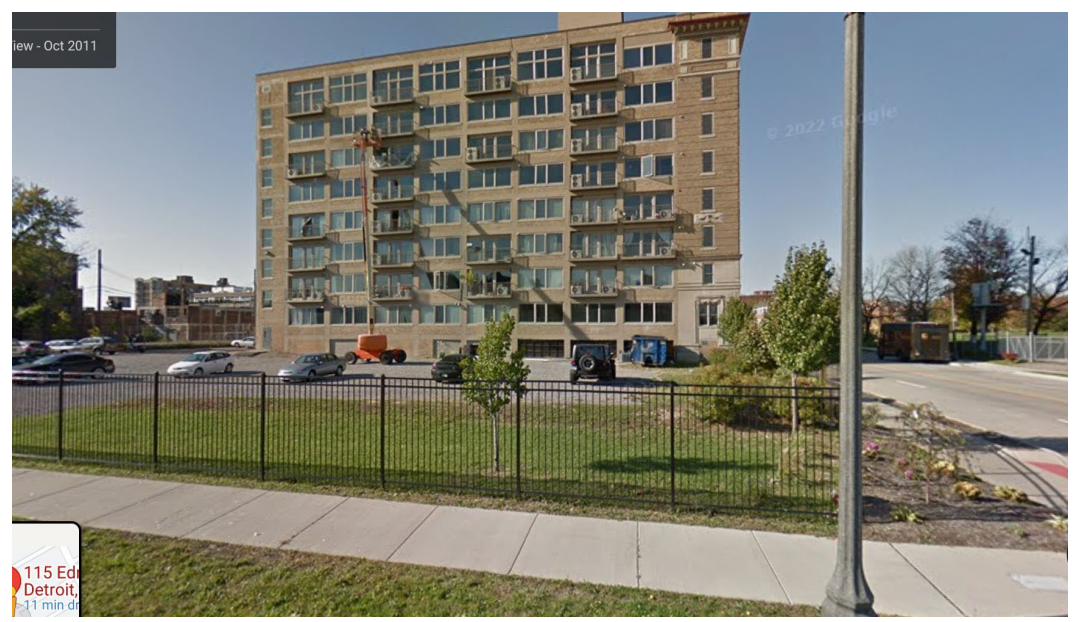
View of property per Google Street View, October 2011. Note new fence, landscaping, and parked vehicles.

• Per Google Street View, the fence, landscaping, and parking lot use dates to at least October 2011. HDC staff could not locate approvals for this work, which occurred after the district was established in 1980.