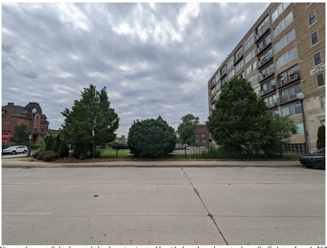
View to the west. Suburban-style landscaping is at odds with the urban character here. Staff photo, June 1, 2022