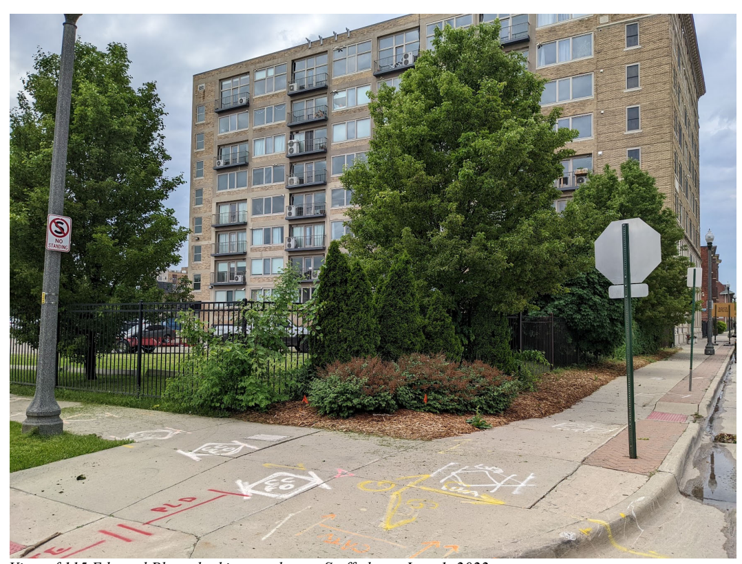
View of 115 Edmund Place, looking northwest, June 1, 2022.

The project site is at the corner of Edmund Place and John R, addressed as 115 Edmund Place. The site is currently unbuilt, with existing decorative fencing and some landscaping at the corner. Although cars were observed parking on the property, it is the understanding of HDC staff that a legal change of use for parking has not been established for this parcel.