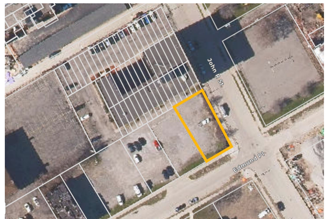
115 Edmund Place outlined in yellow, per Detroit Parcel Viewer.