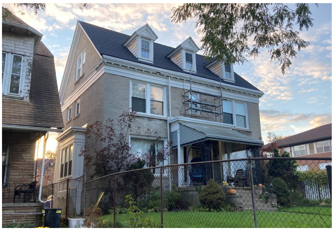
259 W. Grand, current appearance