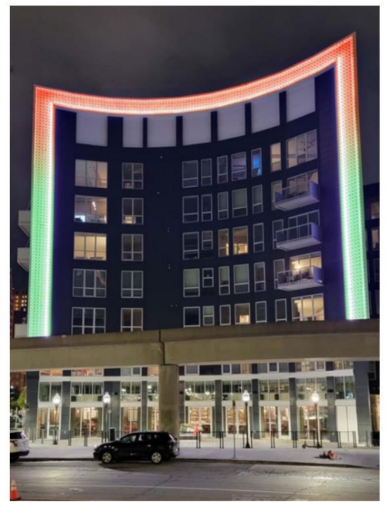
1501 Washington (313 Park Avenue), front elevation showing unapproved changeable colored lighting

Please note that the approved permit drawings did not allow for changeable/multicolored lighting. HDC staff has also noted that synthetic greenery had been added to several areas at the front and side elevation, first story. This element has not been approved by the HDC.