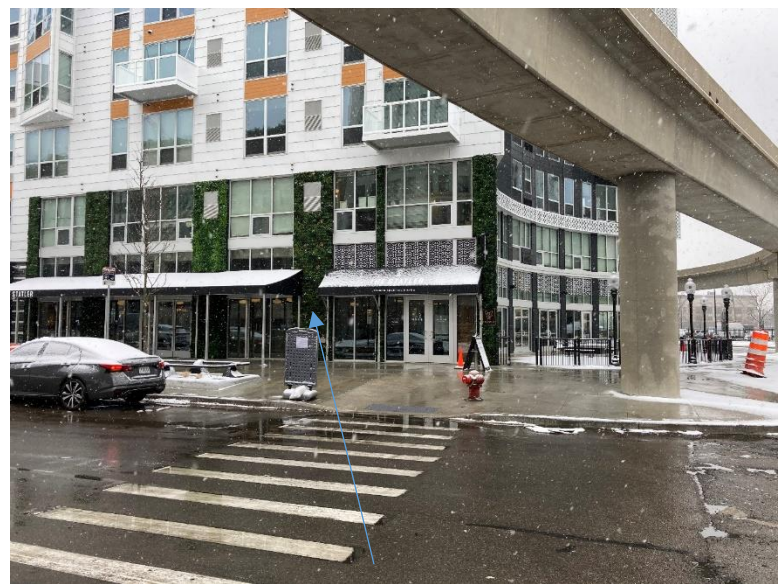
1501 Washington (313 Park Avenue), side elevation showing unapproved synthetic greenery

Please note that the approved permit drawings did not allow for changeable/multicolored lighting. HDC staff has also noted that synthetic greenery had been added to several areas at the front and side elevation, first story. This element has not been approved by the HDC.