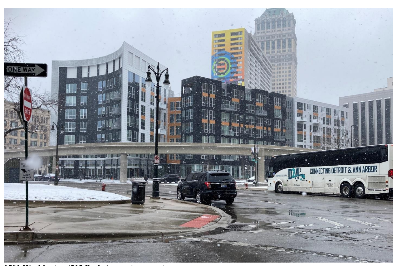
1501 Washington (313 Park Avenue), current appearance

Erected in 2019-2020, 1501 Washington (313 Park Avenue) is a mixed-use building which includes commercial space at the first story and residential units in stories two through seven. The building features a triangular footprint with an interior courtyard area. The roof is flat and exterior walls are clad with brick, metal panel, and cement fiber siding. Aluminum storefronts are located at the first story while fixed and operable aluminum windows are located at the residential units.