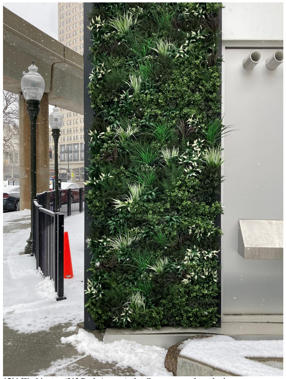
1501 Washington (313 Park Avenue), detail, unapproved synthetic greenery

With the current submission, the applicant is seeking the Commission's approval to retain the synthetic greenery as installed. The applicant is also seeking the Commission's approval to display colored lighting at the front elevation for a specific number of days throughout 2022. Finally, the applicant is seeking the Commission's approval to utilize the parapet area at the front and side elevations (see the below) for the installation of changeable art/murals.