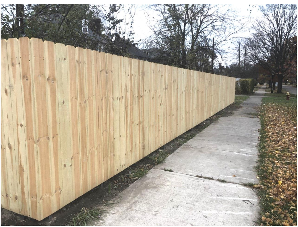
At the corner of Burns and Mack, looking south into the Indian Village Historic District. November 19, 2021

• There are several examples of full corner front yard fencing, including vacant lots, within the Indian Village Historic District. The consistent detail these installations share is a high degree of transparency. Following this staff report are three different fencing designs, or conditions, to demonstrate a more transparent front yard enclosure.