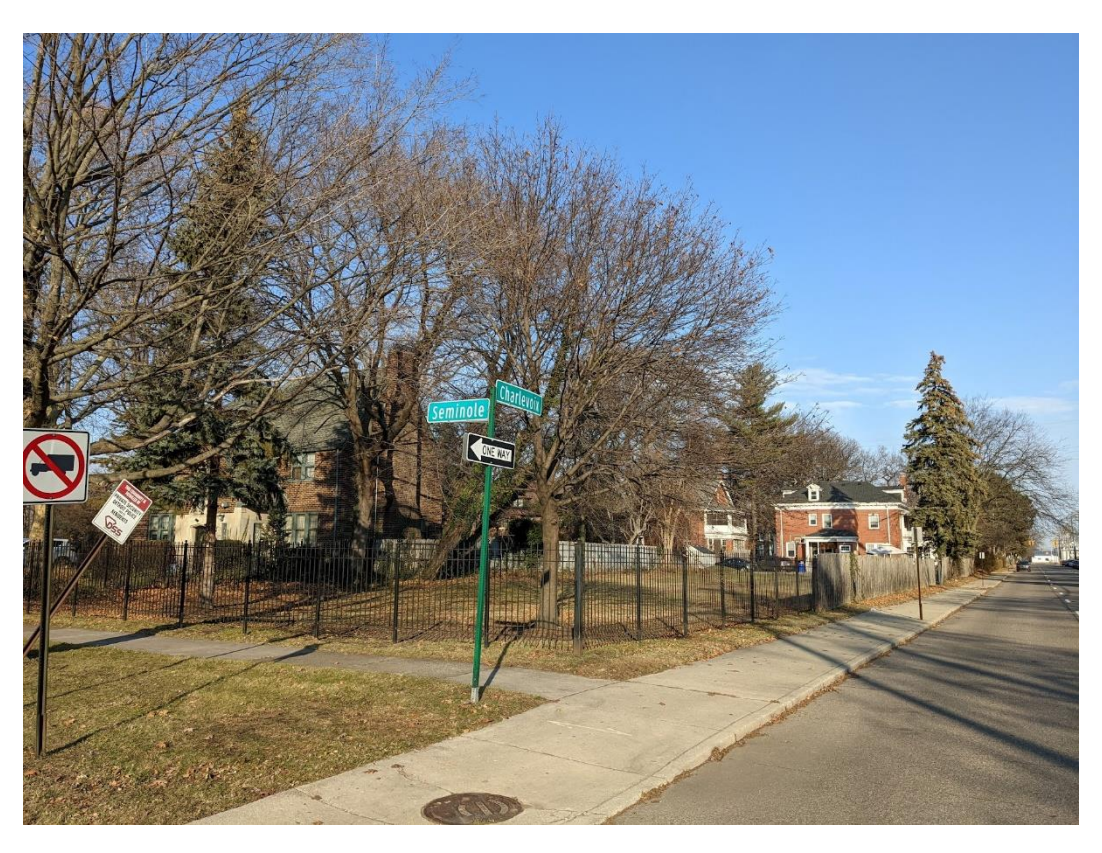
Nor the ast\ corner\ of\ Seminole\ and\ Charlevoix-Condition\ "B",\ open\ fence\ with\ transition\ to\ wood-one\ zone