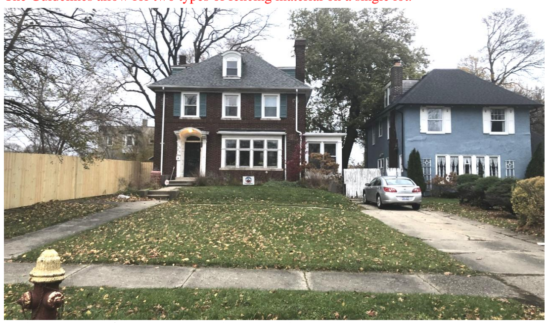
Looking east at 3536 Burns. November 19, 2021

• The style and material are consistent with the Fence and Hedge Guidelines and appropriate to the district. The Guidelines allow for two types of fencing material on a single lot.