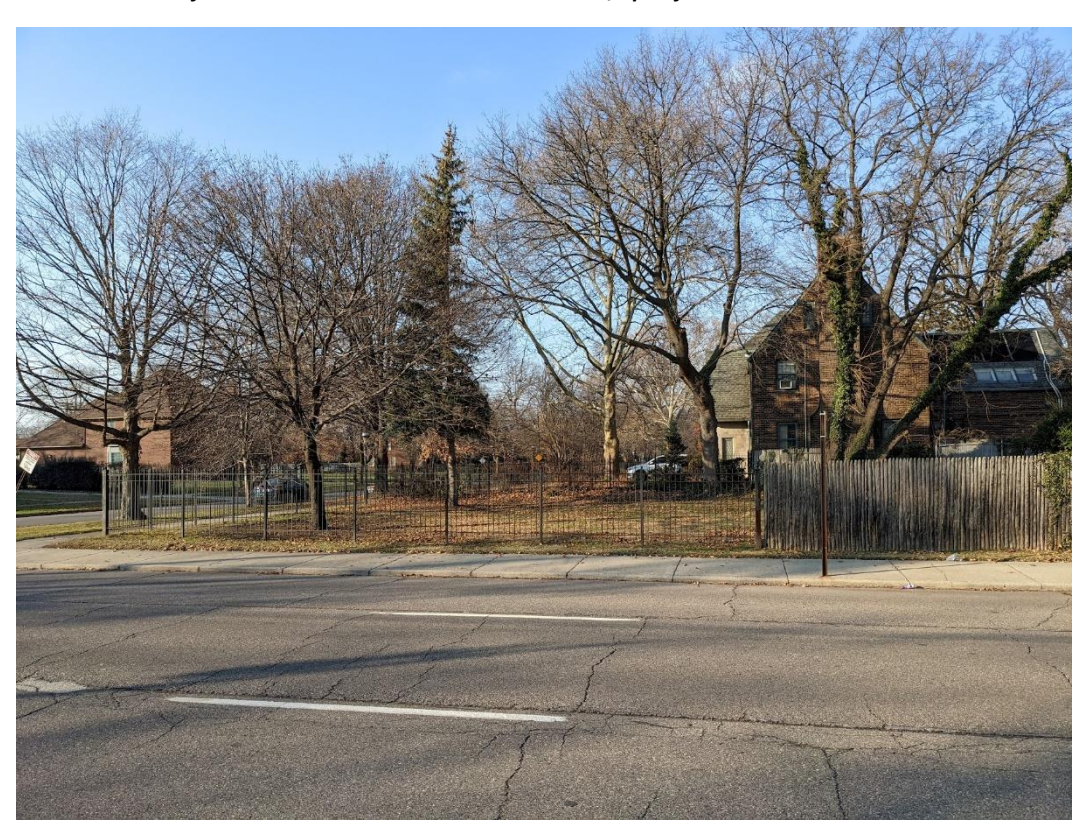
Another view of same location Condition "B", open fence with transition to wood at setback line