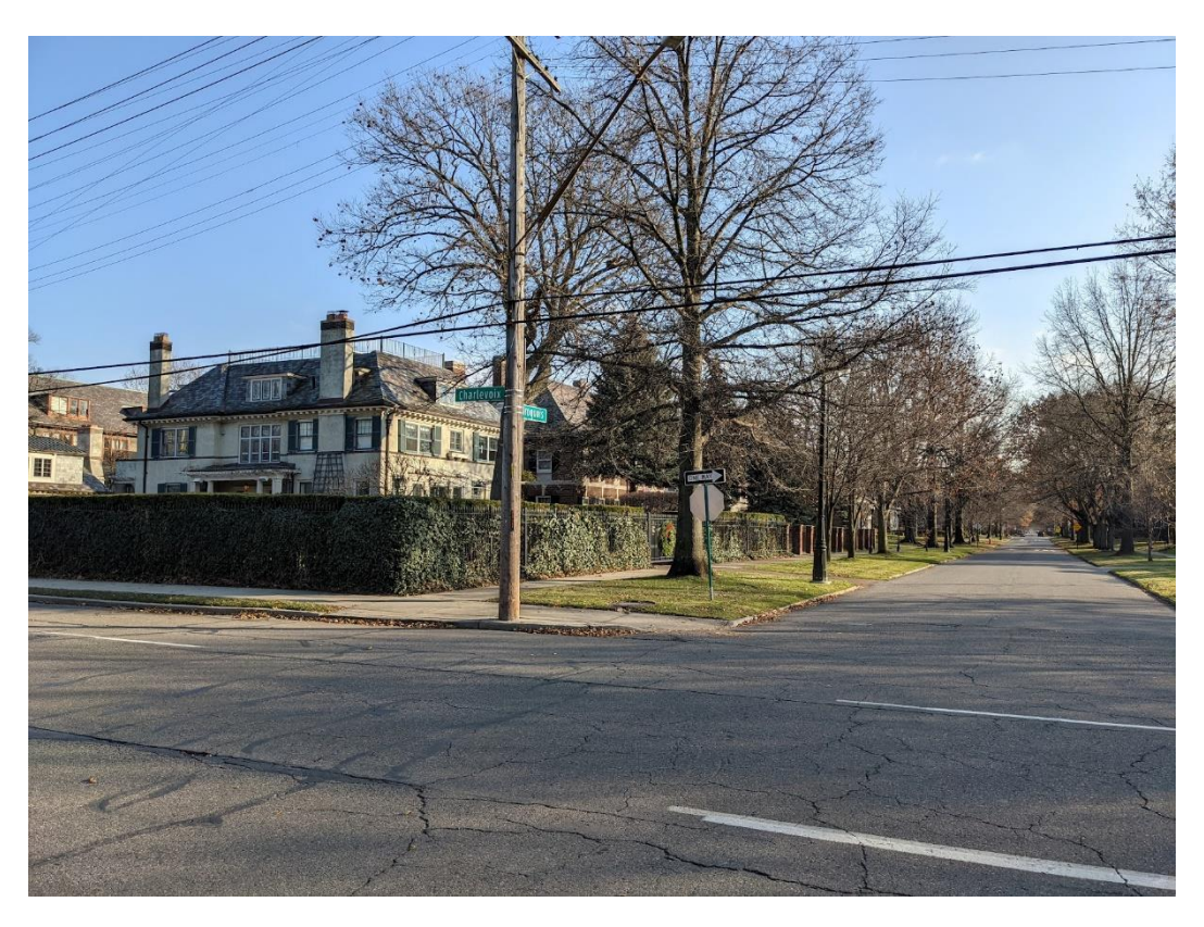
Southeast corner of Iroquois and Charlevoix, Condition "A", full transparent fence (grown in)