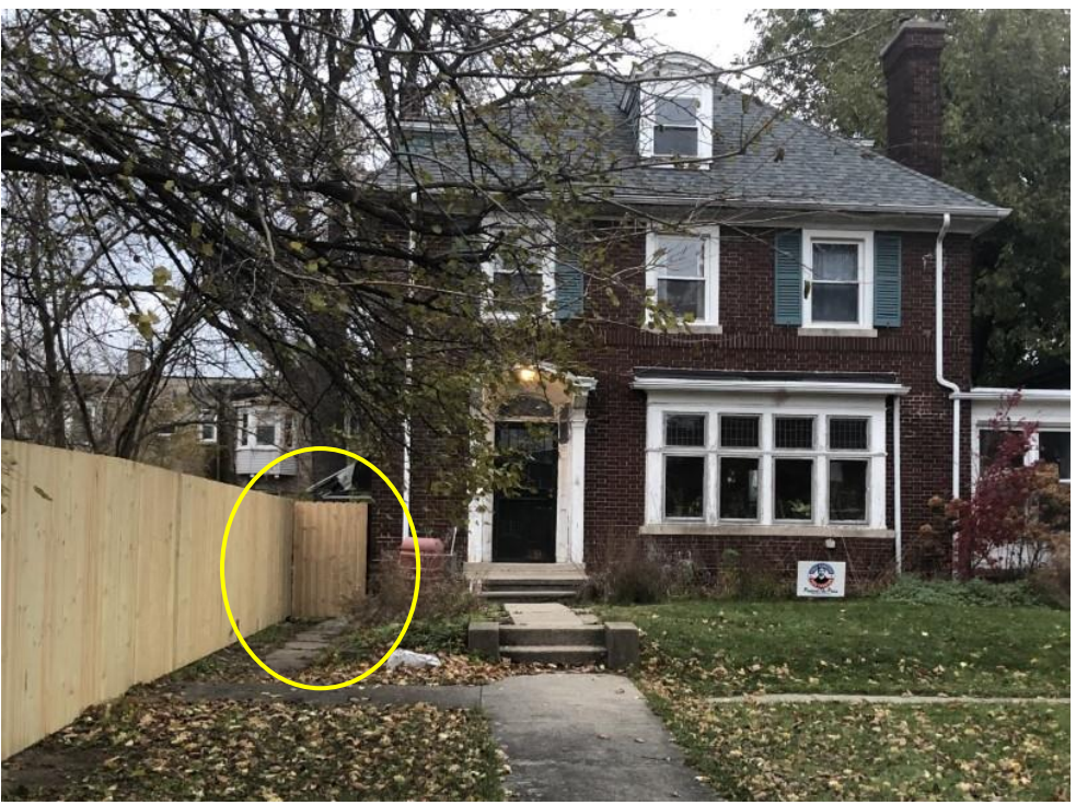
Looking east from the Burns sidewalk, showing a small section of fence properly aligned with the setback line. HDC staff photo, November 19, 2021