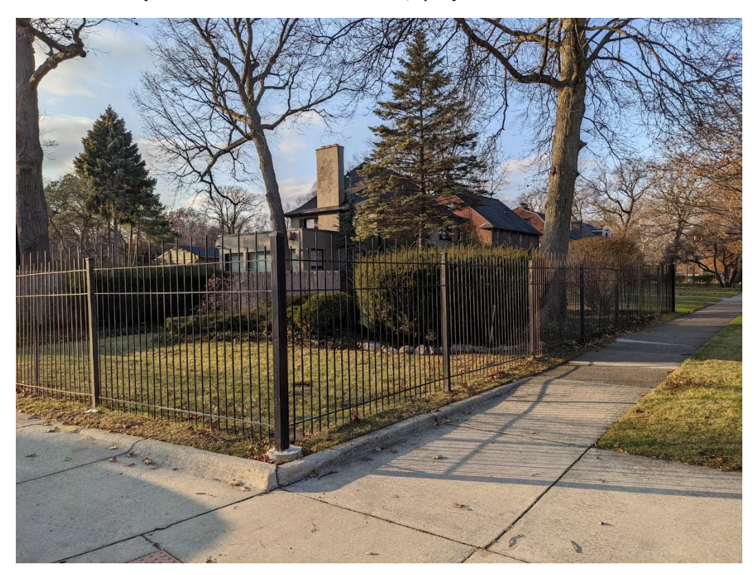
Northwest corner of Burns and Charlevoix – Condition "C", open fence with transition to wood – two zones