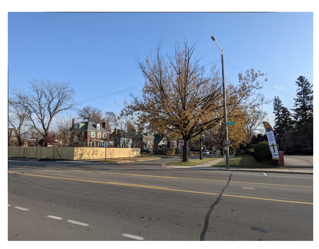
Wide view of existing conditions at 3546 Burns (subject of review)