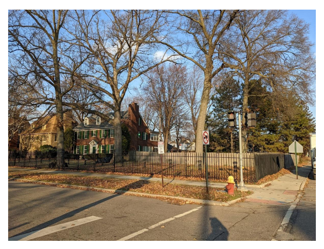
Northeast\ corner\ of\ Burns\ and\ Charlevoix-Condition\ "C",\ open\ fence\ with\ transition\ to\ wood-two\ zones