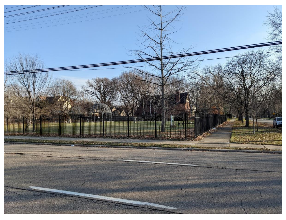
Southeast corner of Seminole and Charlevoix, Condition "A", full transparent fence ("Centennial Garden")