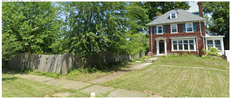
Above: Google street view, August 2019. Below: HDC staff photo, November 2021.

• HDC staff doesn't know the exact date a fence was installed around the perimeter of 3546 Burns. However, a violation is listed in the Detroit Property Information System at 3536 Burns, dated May 10, 1999, for a "side yard wood fence at sidewalk".