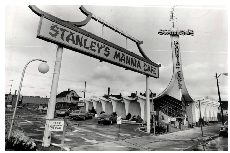
Late 1970s view of the district. Detroit Free Press, 11/9/21.

The roof system is composed of Steel I-beams and girders that supported corrugated metal decking and an insulation layer, which was then finished with roll out rubber and tar. The roofing material wraps up to cover the backside of the parapet (rising 25" above the roof line) on the north and the east sides of the building, and on the embellished south and the west sides, the roofing material slopes up to meet and partially cover the backside of the inverted concrete parabolas - peaks of which rise approximately 18 inches above roof line.