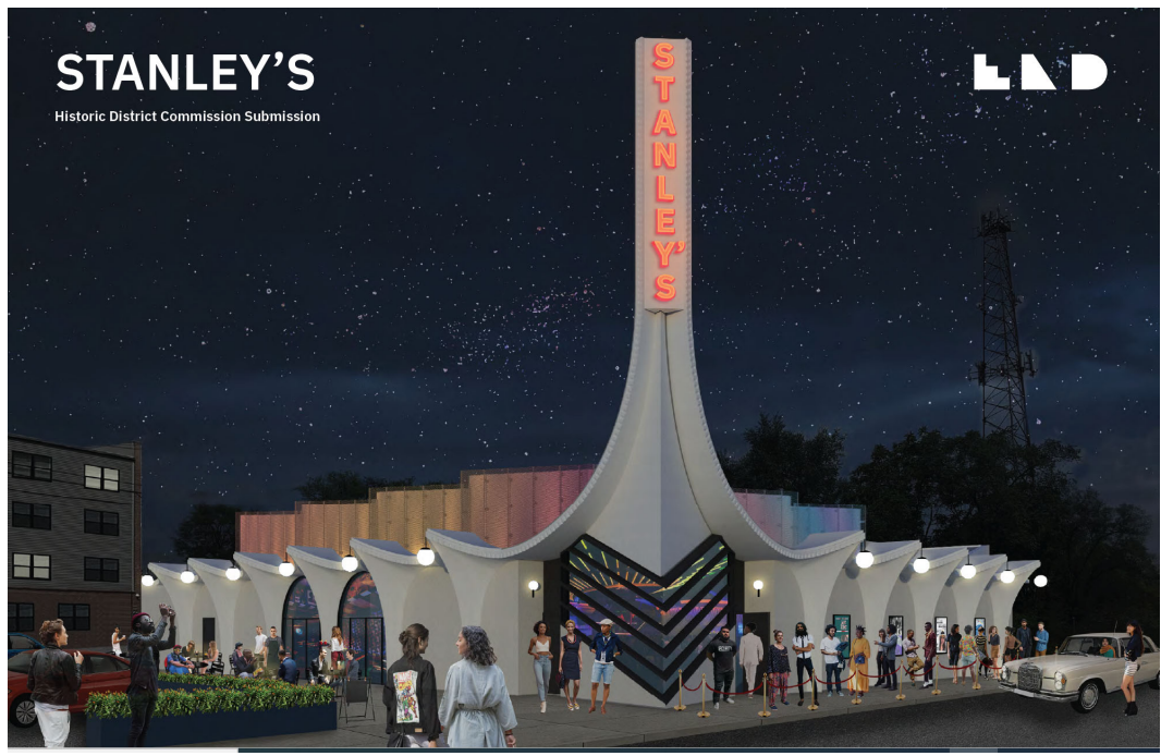
One of several renderings provided in the applicant's submission materials.

Note that signage, exterior lighting, and sitework are not included in the current application.