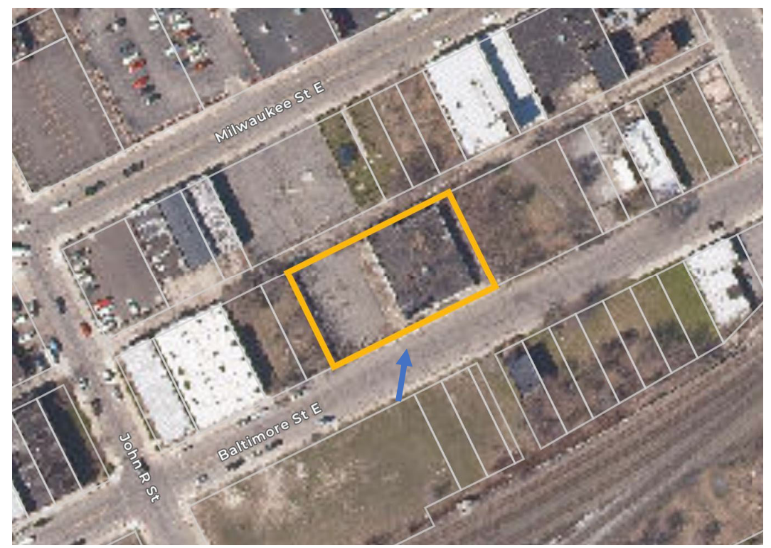
Parcel view of vicinity, subject parcel outlined in yellow. Blue arrow shows location of photo on first page.