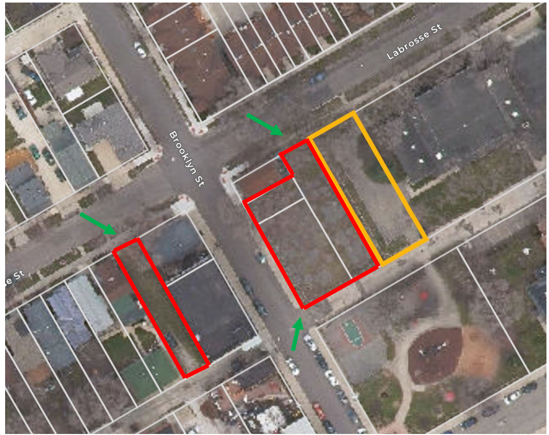
Parcel view of vicinity, with subject parcels outlined in red. The parcel outlined in yellow, 1245 Labrosse, is now occupied by an addition to the adjacent school, approved by the Commission in 2018. Green arrows indicate photo locations of the previous three images.