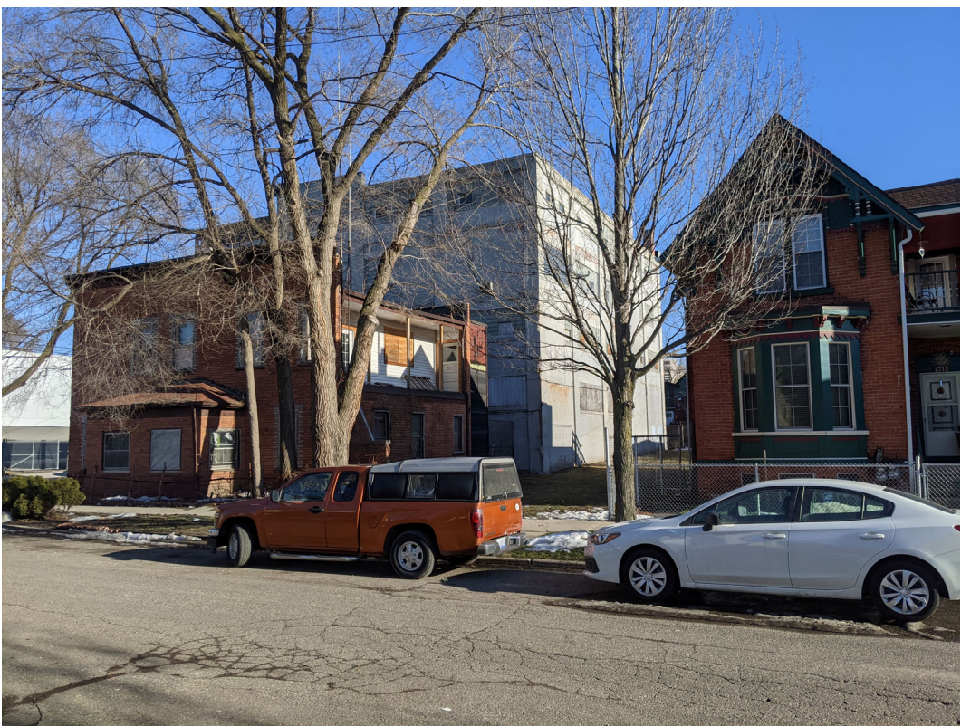
View of vacant lot at 1309 Labrosse (roughly between trees), looking towards the southeast. The orange truck is parked at the approximate location of the proposed curb cut. Staff photo, February 26, 2021.

The west site, 1309 Labrosse, is a former residential lot immediately west of and adjacent to 1451 Brooklyn (reviewed at the February 10<sup>th</sup> meeting) and the Kaul Glove building. A former single-family dwelling on the site was demolished at an unknown time, but likely before the district was established. Current conditions are a lawn which appears to maintained (mowed) from street south to the alley. There appears to be no established use of a parking lot on the site, and there are no curb cuts allowing vehicular access to the lawn.