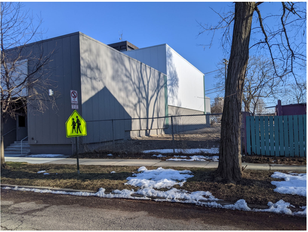
View of 1256 Labrosse (chain link fence) showing location of proposed curb cut. Staff photo, February 26, 2021.