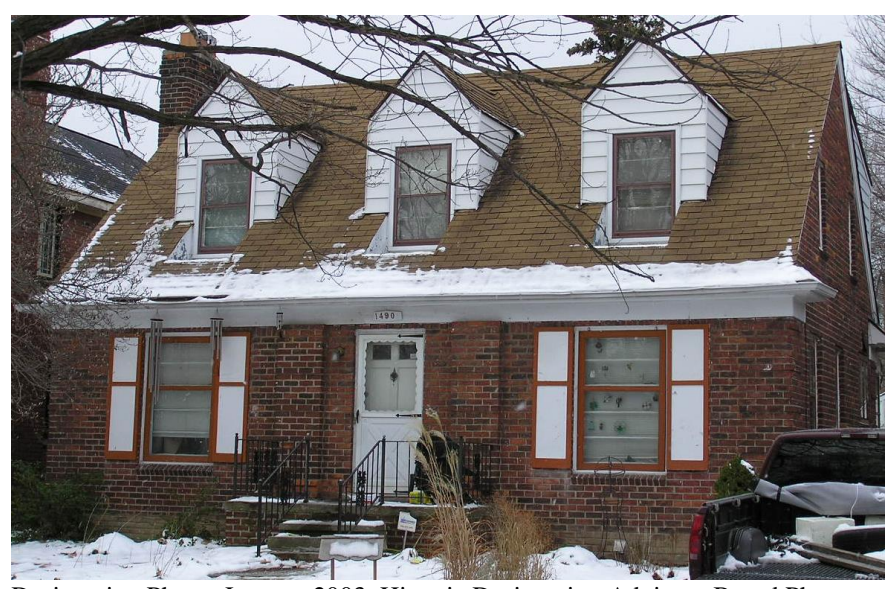
Designation Photo: January 2003

As shown on the Sanborn map, only one rear projection was originally at the southeast corner of the house at the time of construction. Using this historic guide, it is evident multiple alterations have made to the rear elevation since 1950. The existing enclosed entry is supported by CMU, rather than brick. The raised patio is faced with brick, which does have an aged appearance, but the enclosure/door openings look contemporary in nature.