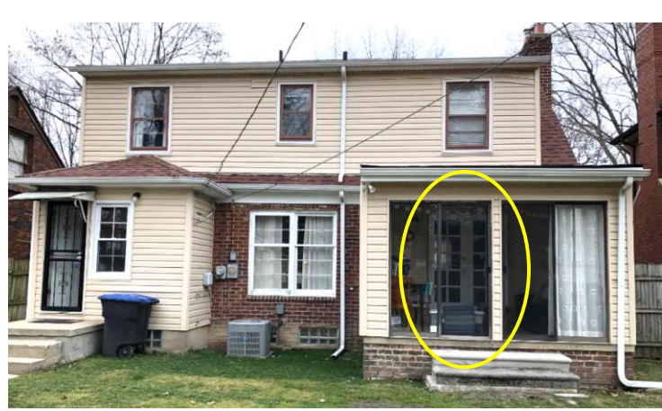
French Door as seen from backyard