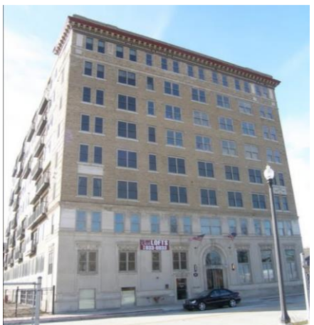
The Carlton Lofts, current.