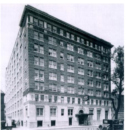
The Carlton Hotel, 1920s.