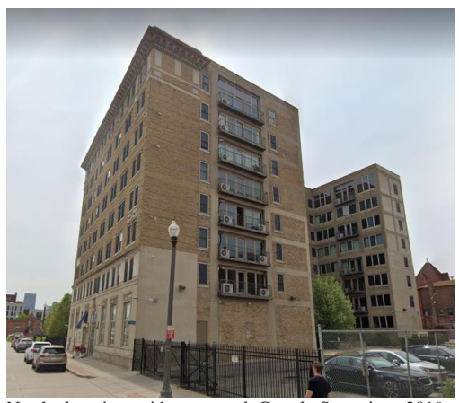
North elevation, with courtyard.