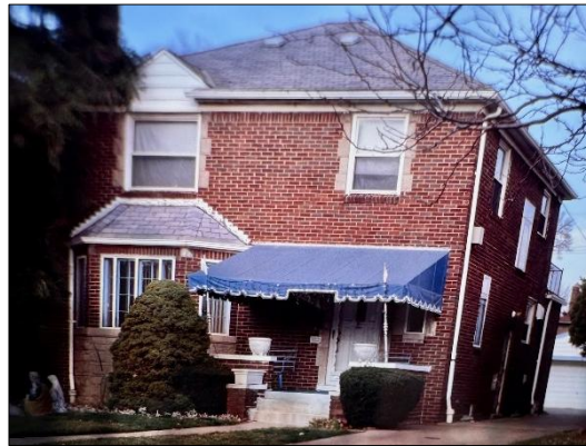
Designation photo, 1999. HDAB