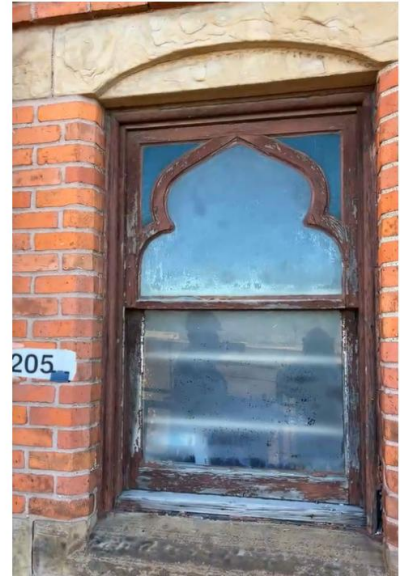
Photos of three sacristy windows provided for replacement/replication.