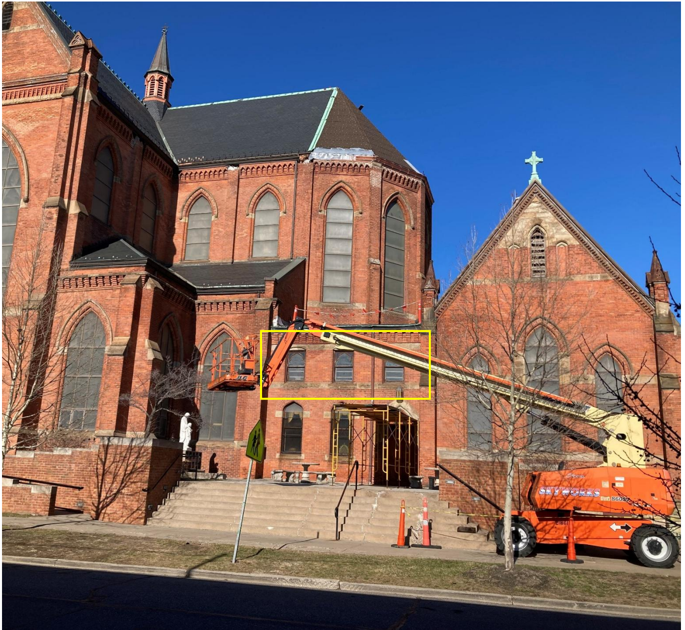
Three windows at basilica proposed for replacement, outlined in yellow. Staff photo taken 4/27/2