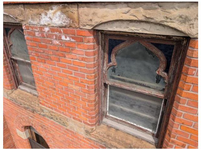
Sacristy windows proposed for replacement, photos by staff 4/27/2026