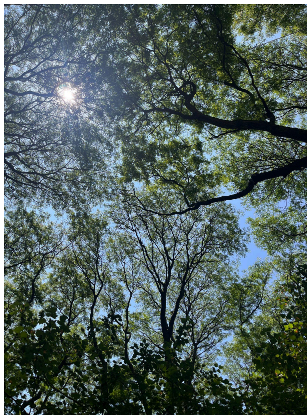
View of canopy from inside the proposed excavation area

Second, they have removed the steam vents from the plan which had previously been identified as necessary for safety. The plan as submitted does not address the issue of burn danger from at-grade manhole covers. In light of the recent class action lawsuit against Detroit Thermal from burn victims in