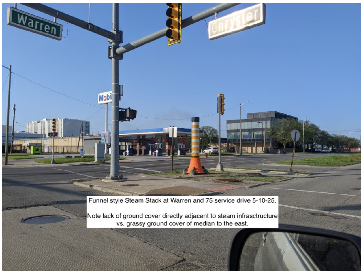
Funnel style Steam Stack at Warren and 75 service drive 5-10-25. Note lack of ground cover directly adjacent to steam infrastructure vs. grassy ground cover of median to the east.