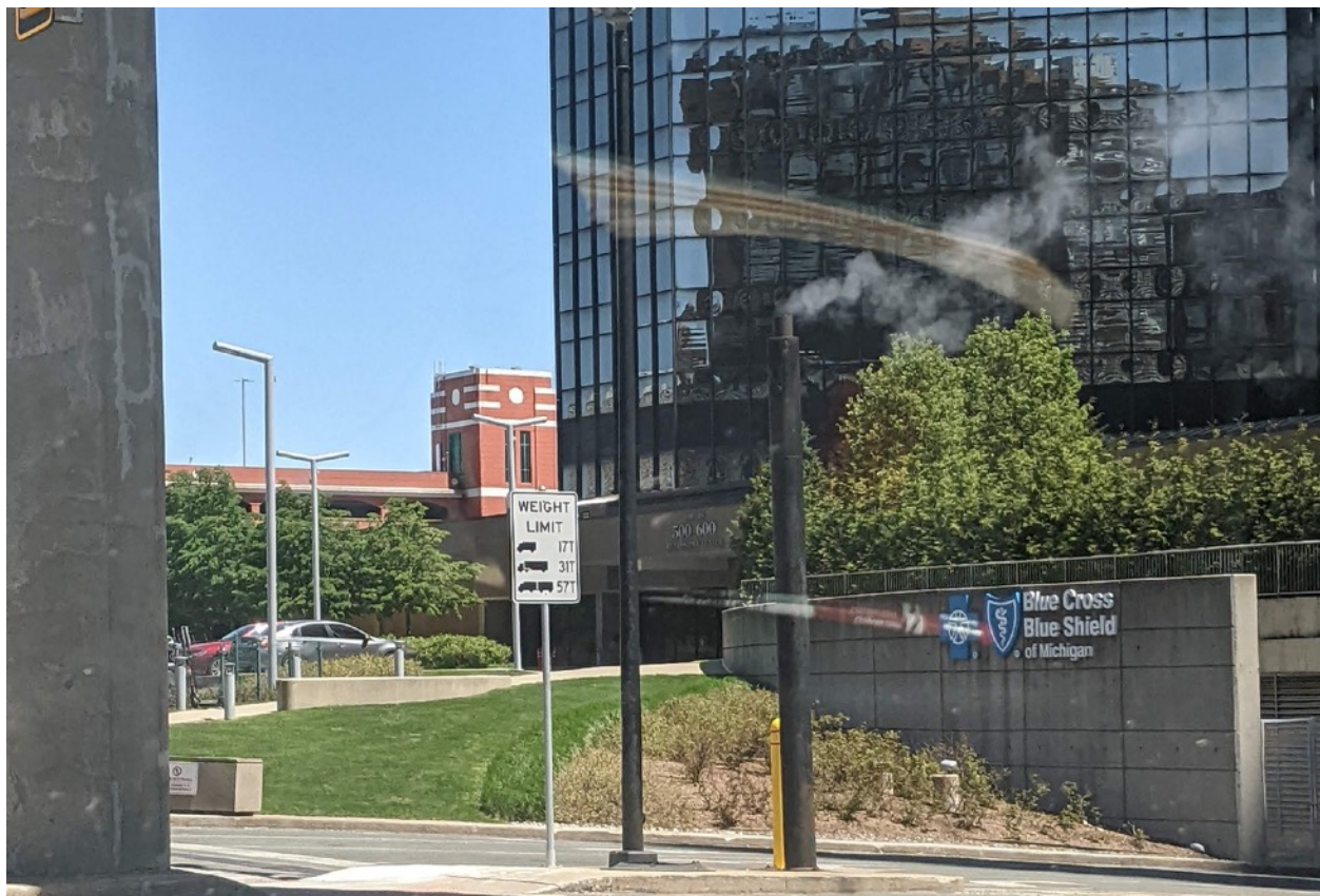
Steam stack at Beaubien and Jefferson emitting steam 5-10-25. Steam emission is more visible in colder temps due to greater temperature differential