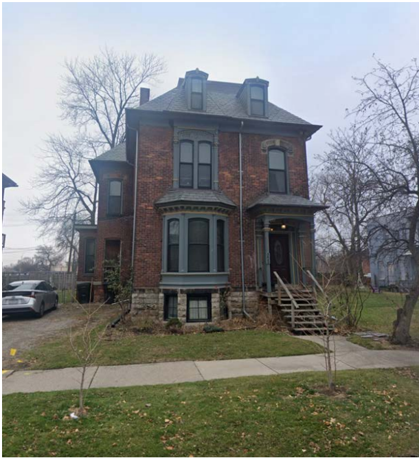
Buildings directly across from proposed development