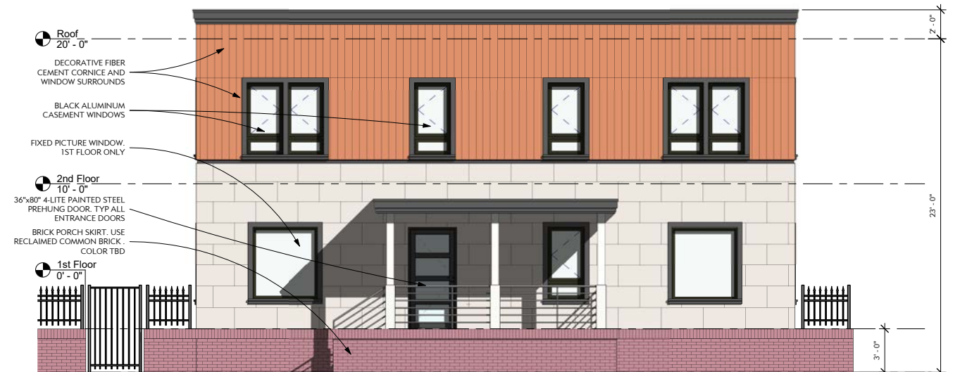
Proposed facade lacks visual interest, does not incorporate any architectural detail to provide context to the neighborhood