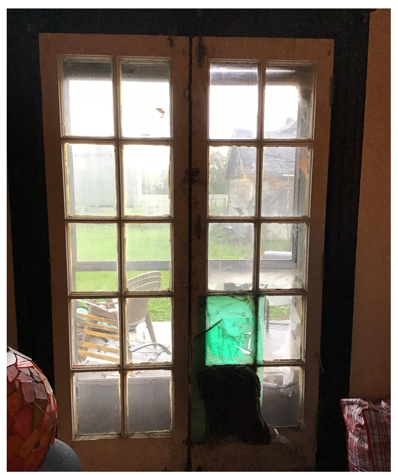
BACK DOOR No door knobs, not a "real" entry door