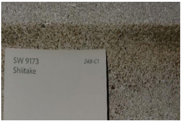
Page 3 of 4