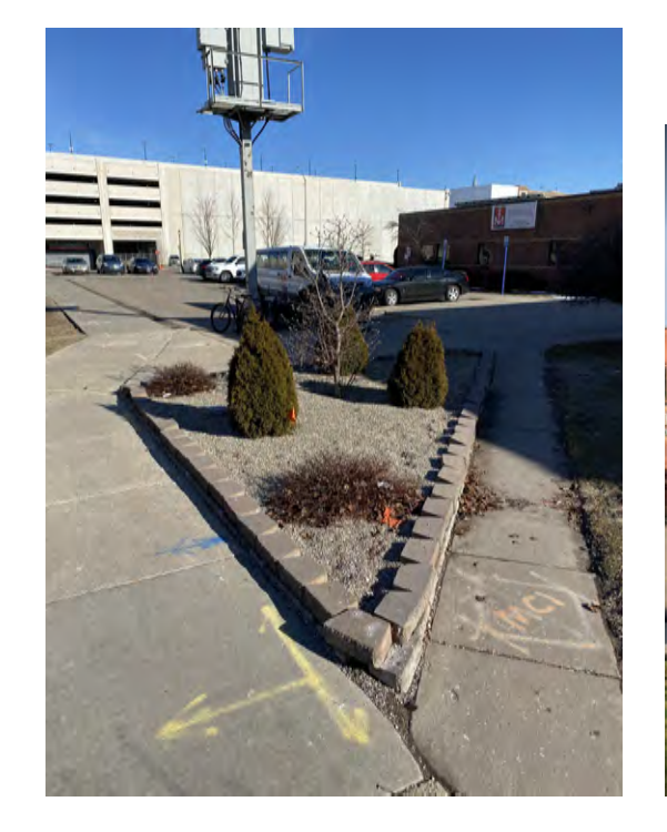
445 Ledyard St, Detroit, MI 48201