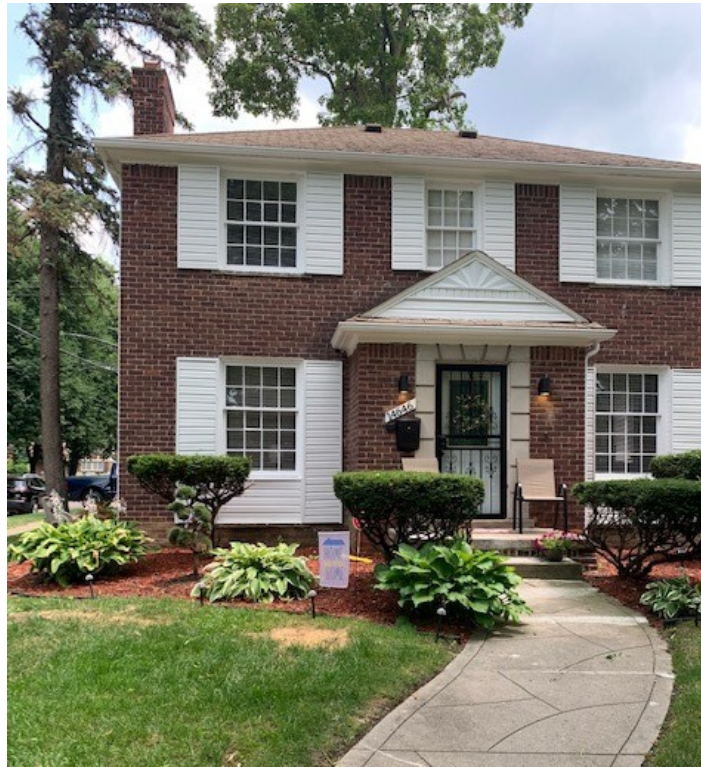
West/ Front Elevation