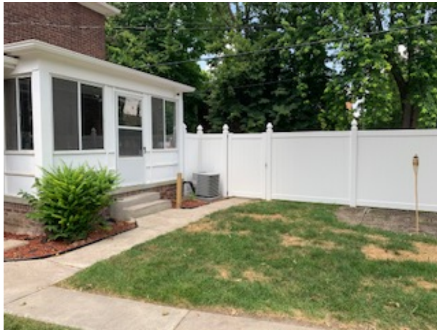
East Elevation – Backyard interior, Vinyl Fence