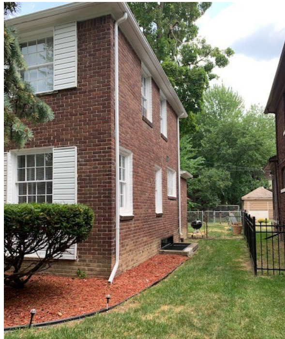
South/ Right Elevation