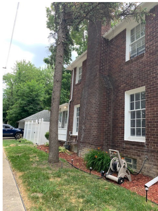
North/ Left Elevation