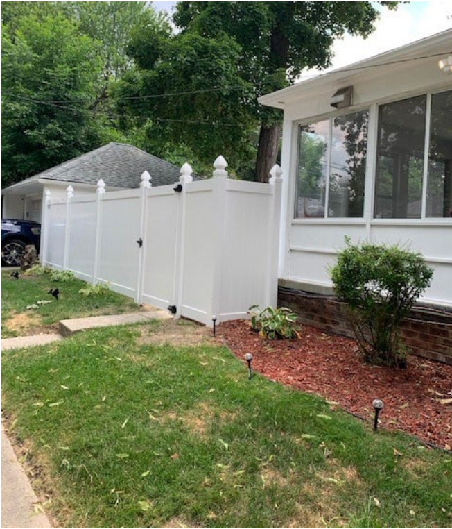
North Elevation (Eaton St View) Vinyl Fence