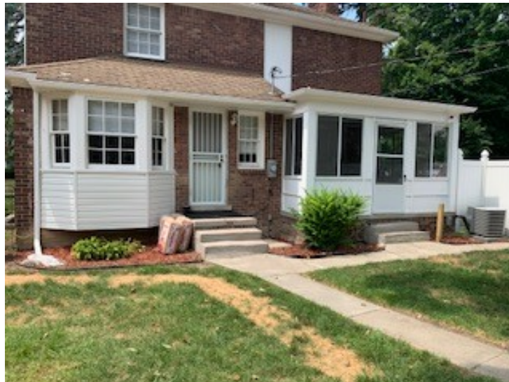
East/ Rear Elevation