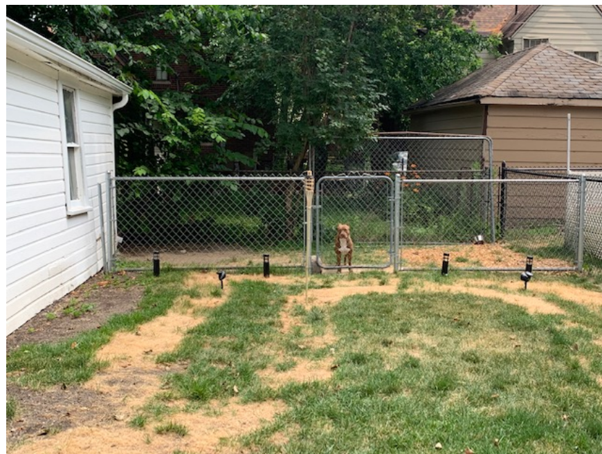
Backyard Dog Run