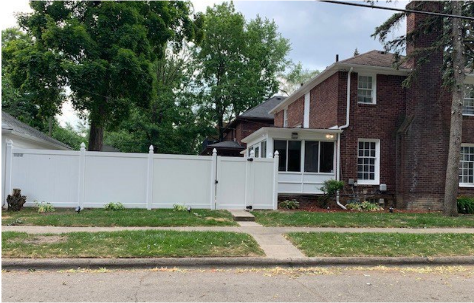
North Elevation (Eaton St View) Vinyl Fence