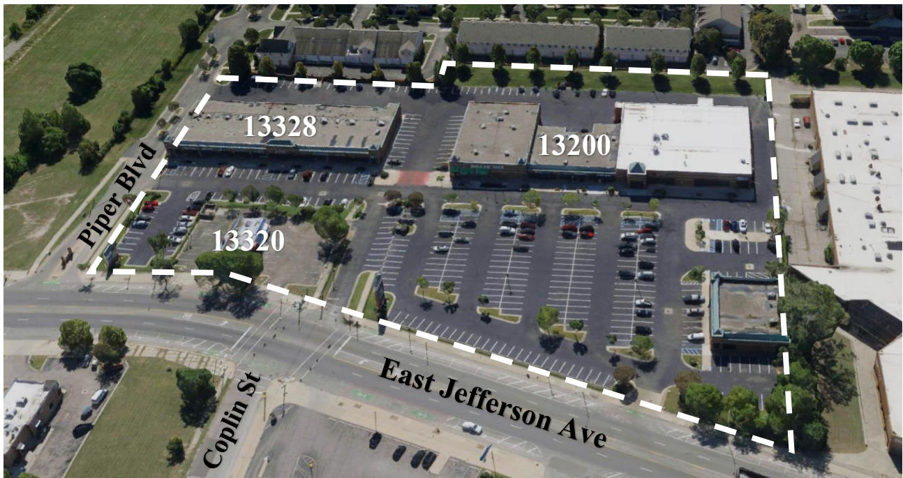
Boundary of Rezoning Area with Taxpayer Addresses

The shopping center currently contains a mix of sales-oriented and service-oriented retail uses. The west half of the shopping center (13200) contains a 41,000 square foot multi-tenant building (Dollar Tree and Medical anchors) and a 6,500 square foot out lot building (O'Reilly Auto Parts) near East Jefferson Avenue. The east half of the shopping center (13328) contains a 25,000 square foot multi-tenant building located behind an existing vacant out lot development that previously contained a drive-through restaurant (13320).