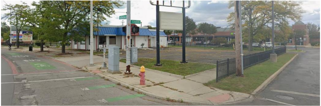
13320 East Jefferson Avenue – CPC Co-petitioner