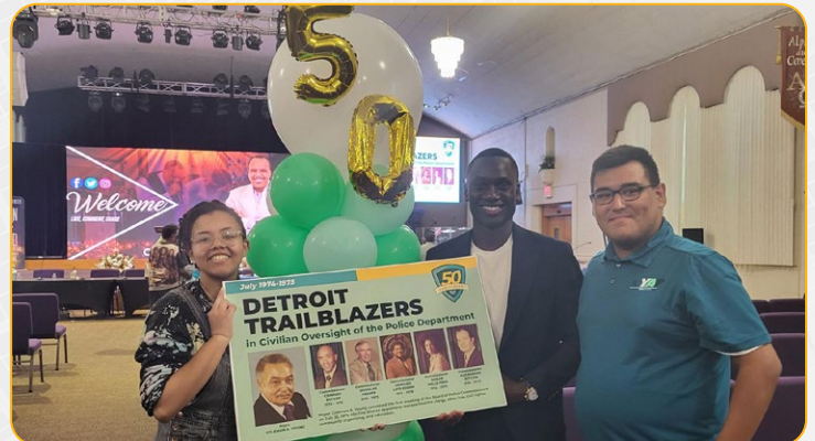
BOPC Youth Advisory Panel hosted the 50th Anniversary Celebration.