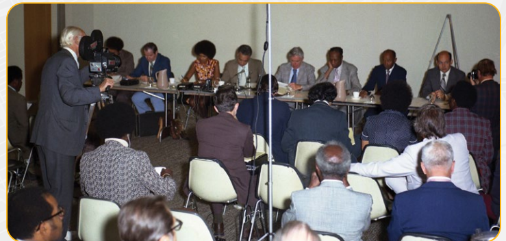
The first official meeting of the Board of Police Commissioners, July 22, 1974.