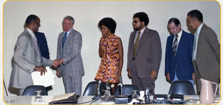
Mayor Coleman A. Young with the first Board of Police Commissioners

The Charter-mandated annual report includes summaries of the handling of complaints, crime trends, police officer demographics, and other data. At any time, however, the public can view recent data on the City website. It includes complaint updates on the Board's police accountability dashboard, launched in 2024 at detroitmi.gov/BOPC . It joins DPD and other public safety information available on the City's the data portal, a mandate from President Obama for greater transparency and access to government, at data.detroitmi.gov .