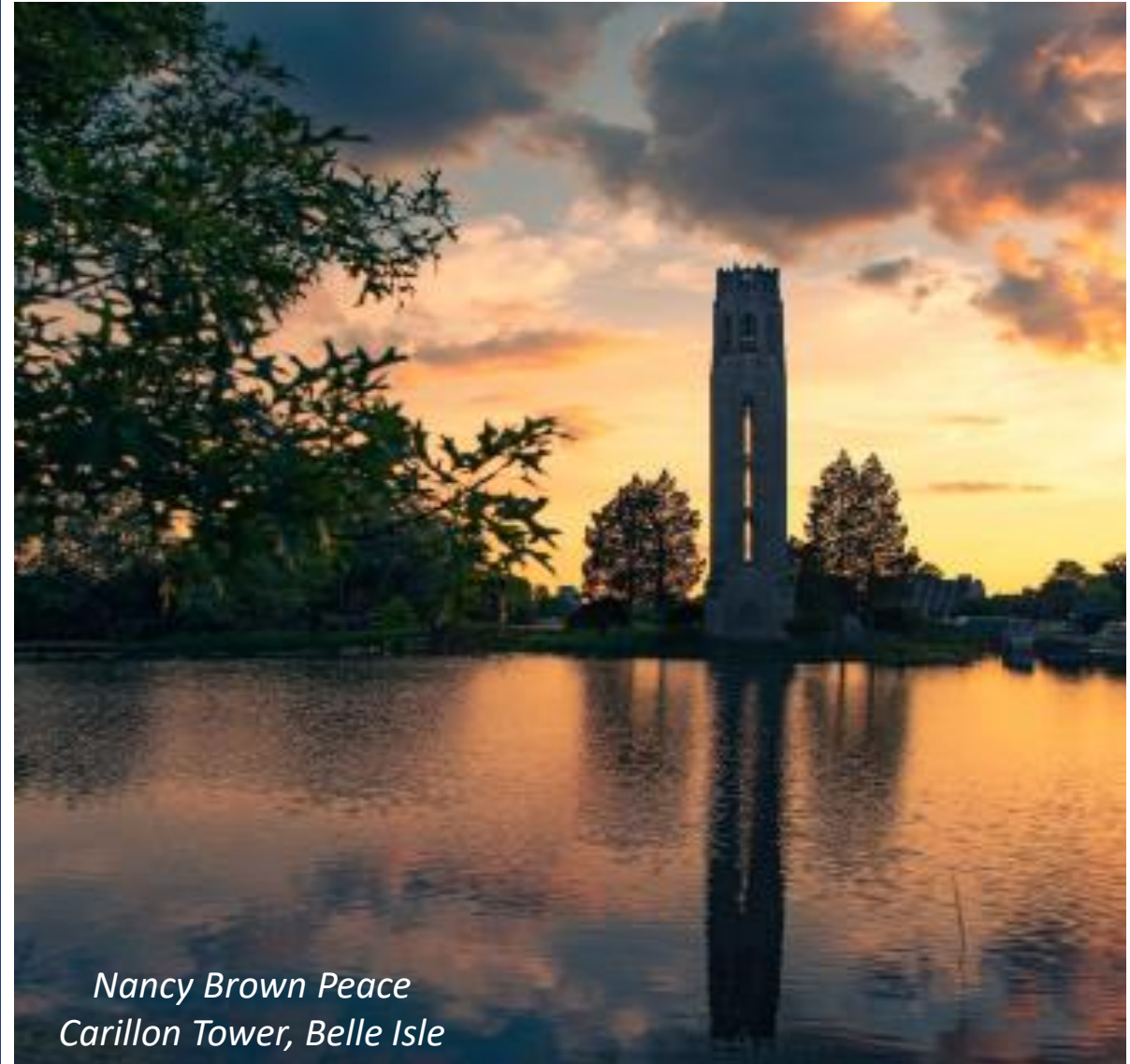
Nancy Brown Peace Carillon Tower, Belle Isle