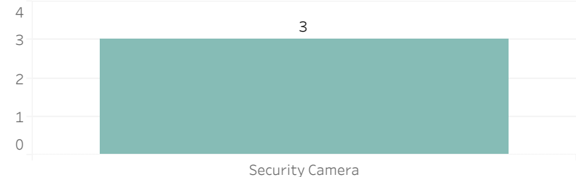
Year to Date Source of Probe Photo