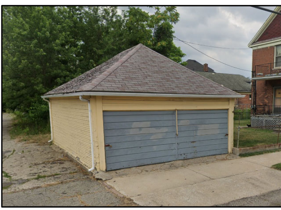
Garage on Wildemere Street