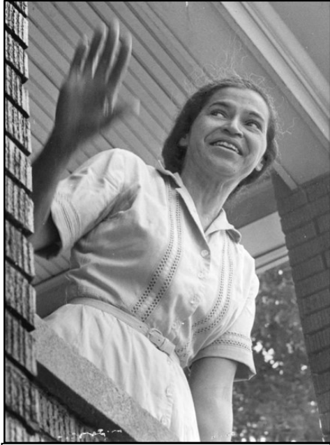
Rosa Parks on the porch of 3201 Virginia Park Street. 1964.