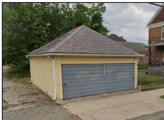
Garage on Wildemere Street