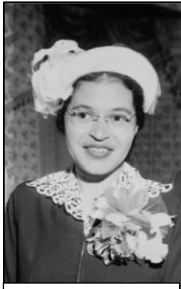
Rosa Parks, screenshot from the documentary, "The Remarkable Life of Mrs. Rosa Parks."

Luther King, Jr.'s nonviolent strategy of civil disobedience, Parks also admired Malcolm X and associated with and supported the activities of black militants in Detroit.