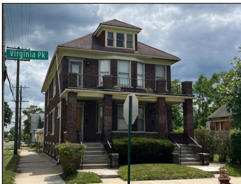
3201-3202 Virginia Park Street