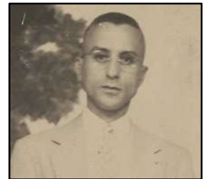
Raymond Parks, ca. 1947