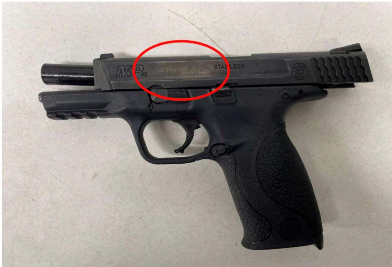
A gun stolen from the Detroit Police Department. (United States District Court)

Smith & Wesson reported stolen from Detroit police in 2014