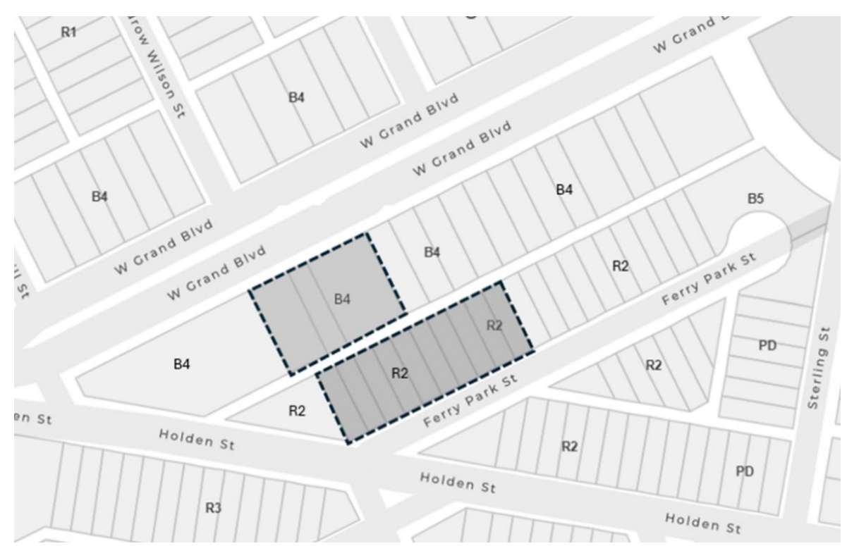
Proposed parcels to be rezoned are shaded and outlined with a dashed line.