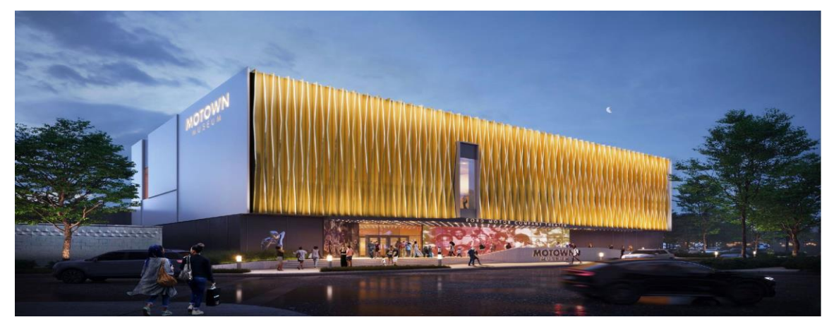
Rendering of the proposed Motown Museum