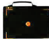
NOVO 12SF 2.2 lbs. (1kg)