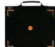
NOVO 15WS 3.5 lbs. (1.6kg)