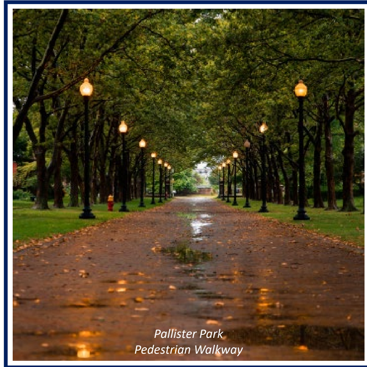
Pallister Park Pedestrian Walkway