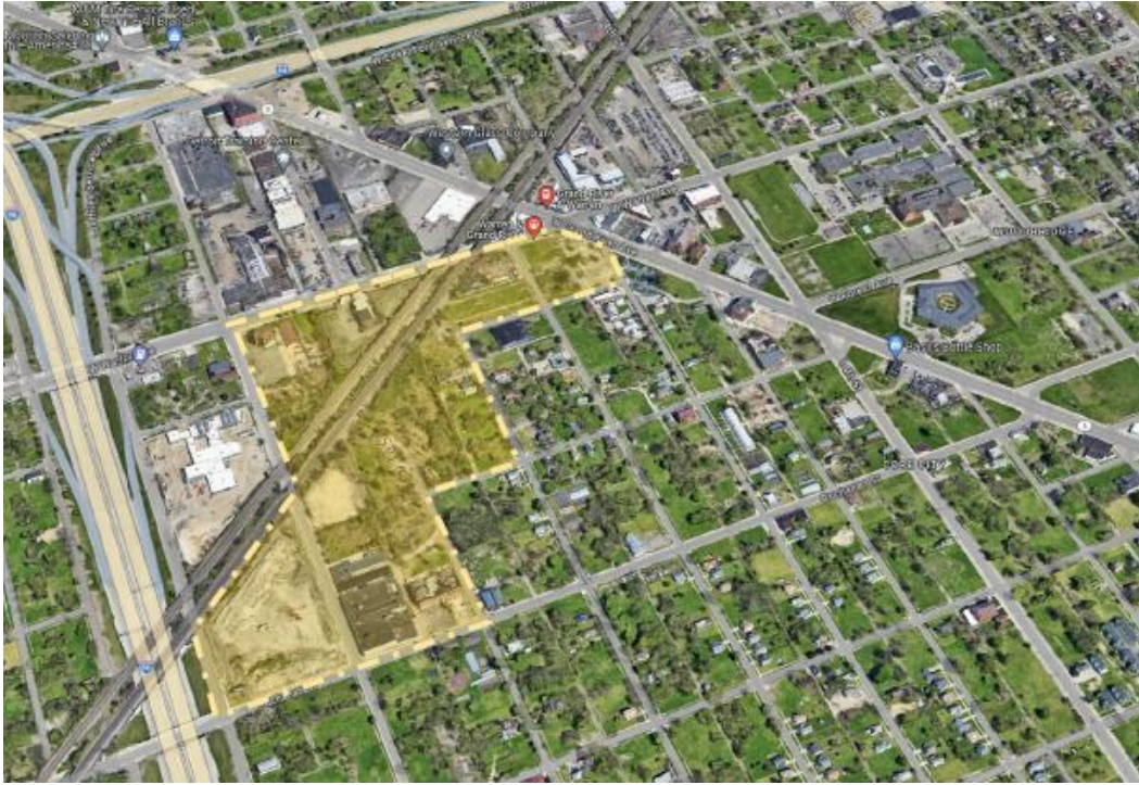
Aerial of rezoning footprint

strong show of support from the community for the staff recommendation of SD2 to proceed (see attached letters of support).