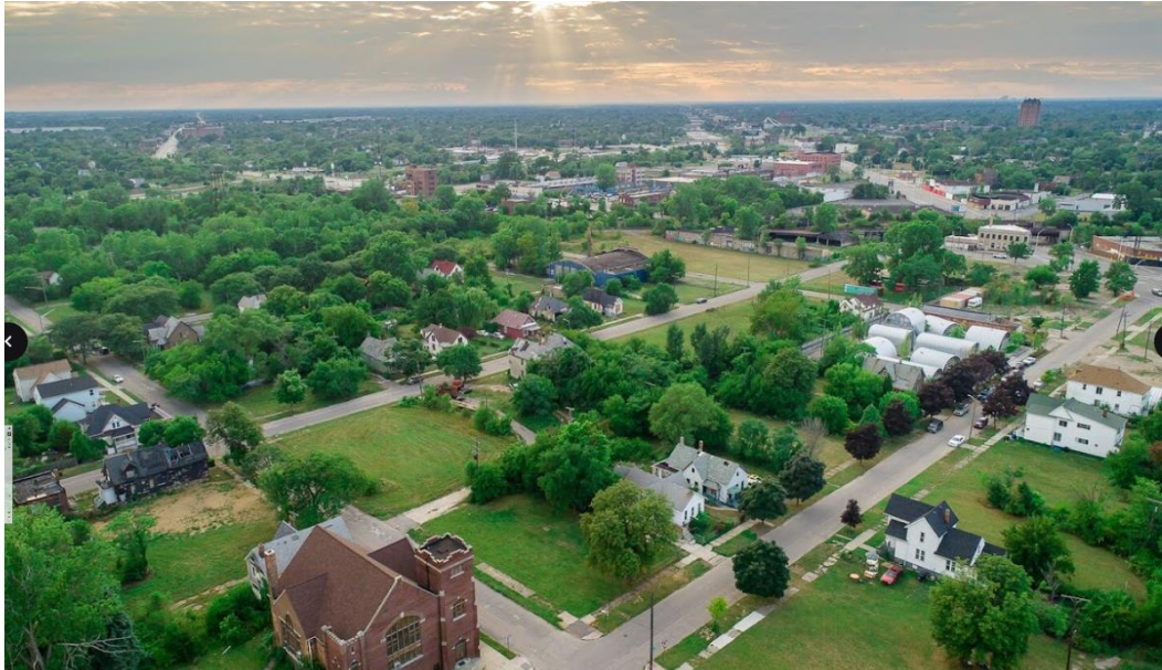
Photograph of the Core City neighborhood

Members of Core City Strong, a community group in the Core City neighborhood, approached the CPC staff in 2023 to discuss issues that they were experiencing in their neighborhood. These community representatives expressed the desired to see their area transition from industrially zoned land to zoning more conducive to a residential community and that would bring in new housing and activities to support the neighborhood and offer protection from future intensive industrial uses.