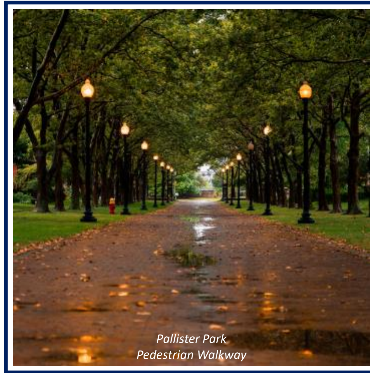
Pallister Park Pedestrian Walkway