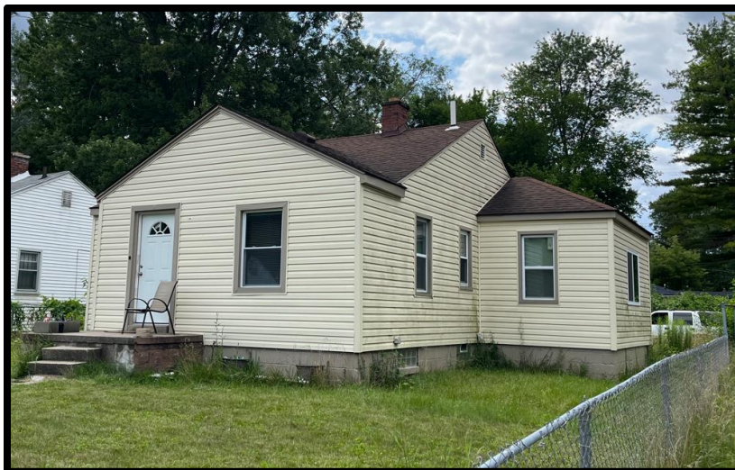
Def Sound Studio House – 18315 Winthrop Street (1943)