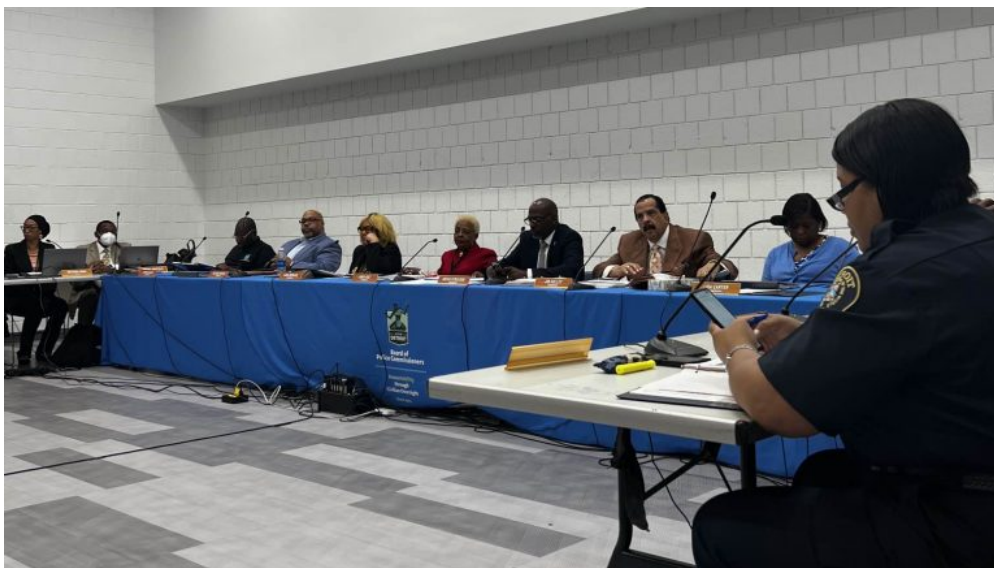
The Board of Police Commissioners held a public hearing at Crowell Recreation Center on Thursday, May 11 to discuss the plan, with input from the Detroit Police Department and concerned community members.

Under the proposal, the agency would install cameras at 25 intersections throughout the city, focusing on areas where vehicles are reported stolen and recovered.