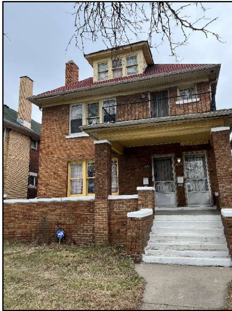
Dr. Lula Belle Stewart House – 8633-8635 Dexter Avenue (1916)