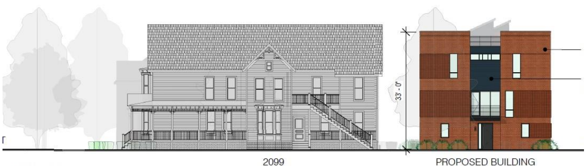
Proposed Elevation facing Dalzelle Street