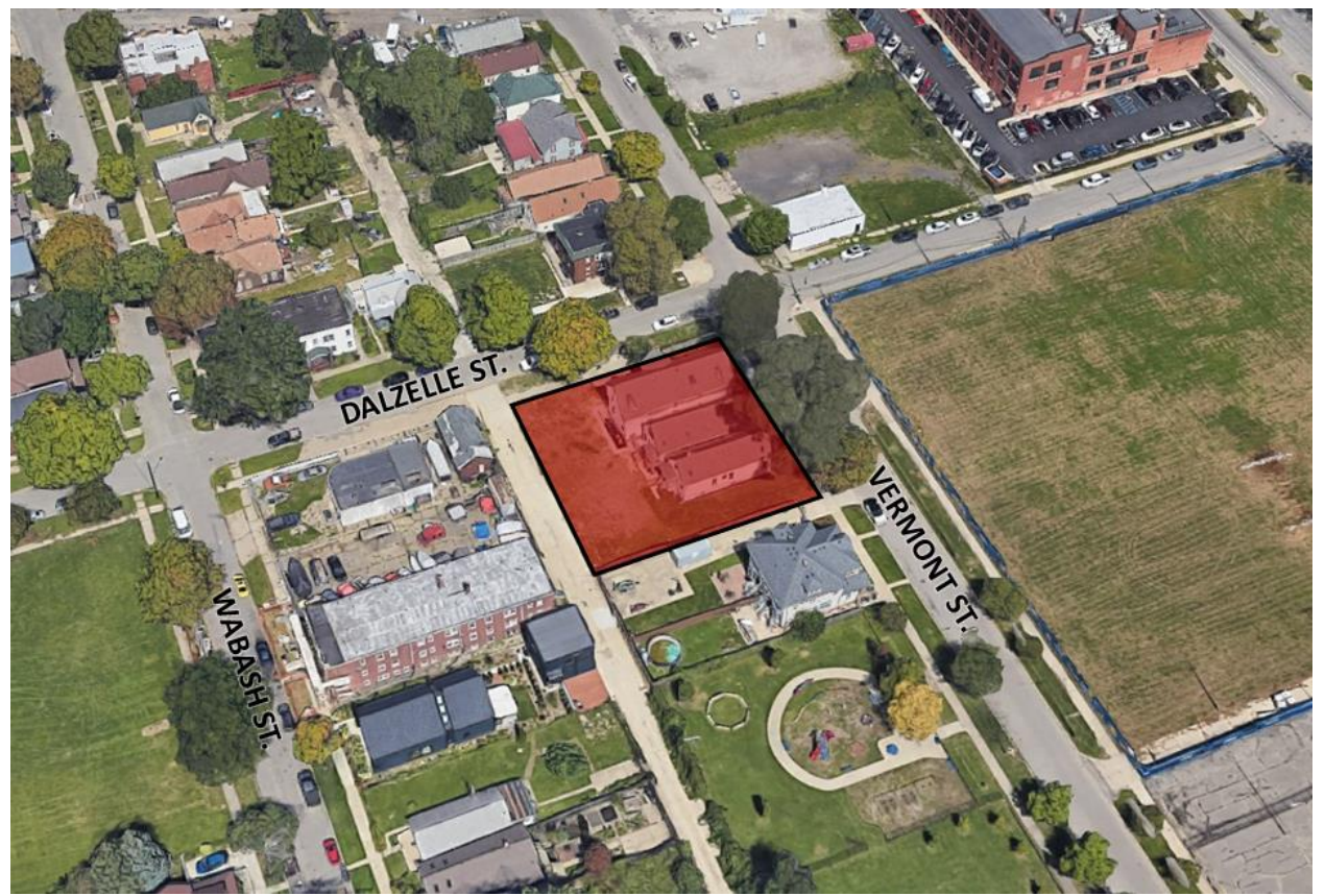
Aerial view of proposed rezoning

The proposed project is not allowed in the existing R2 district because multiple principal buildings are not allowed on one lot (Sec. 50-8-56). Also, several dimensional variances would be required as the proposed structure does not comply with setback, lot coverage, floor area ratio (FAR), or parking requirements. No other residential district would allow the project without multiple variances; the SD1 district would mostly allow it, but it would also permit commercial uses which would not be appropriate for the area.