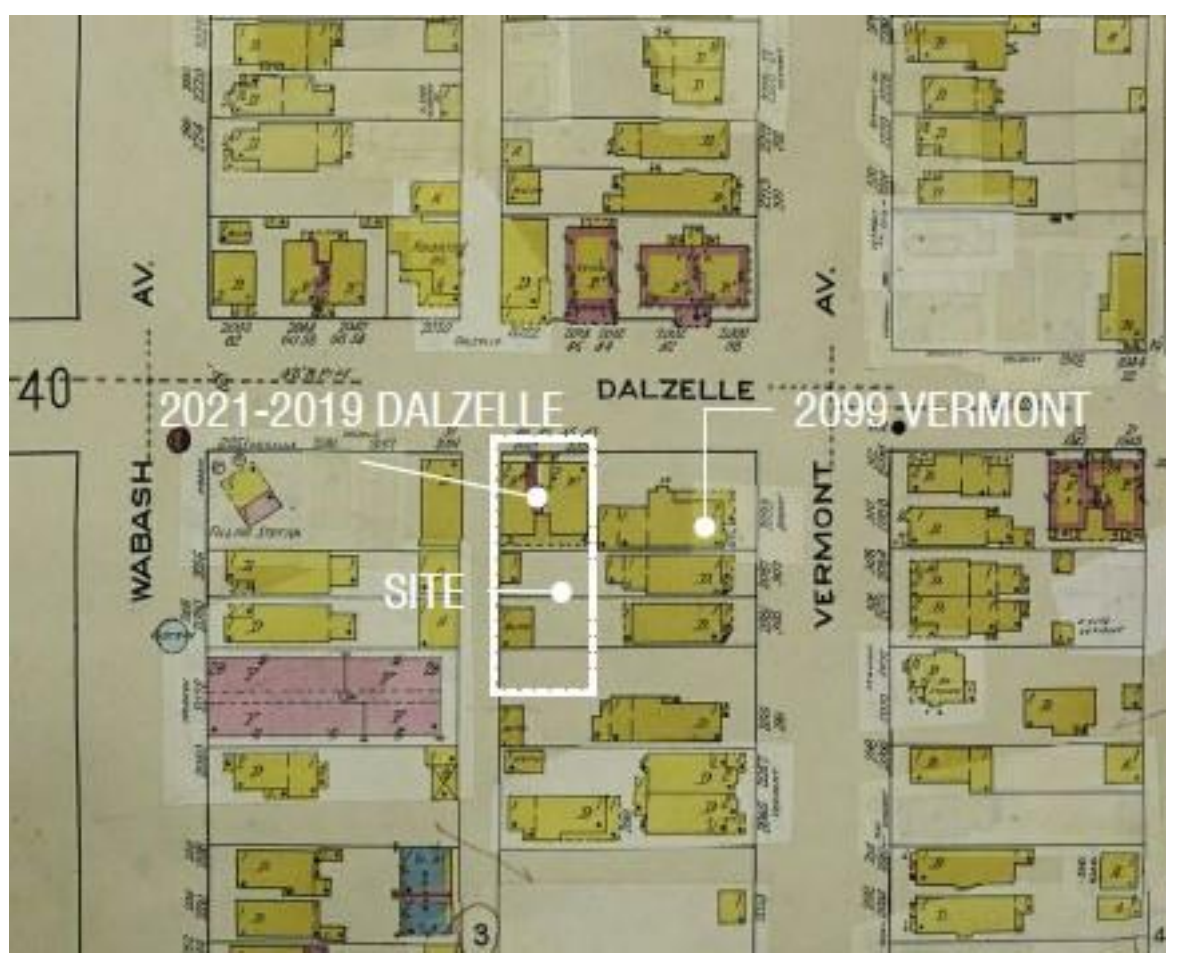
Historic Sanborn Map (approx. 1950) showing neighborhood context