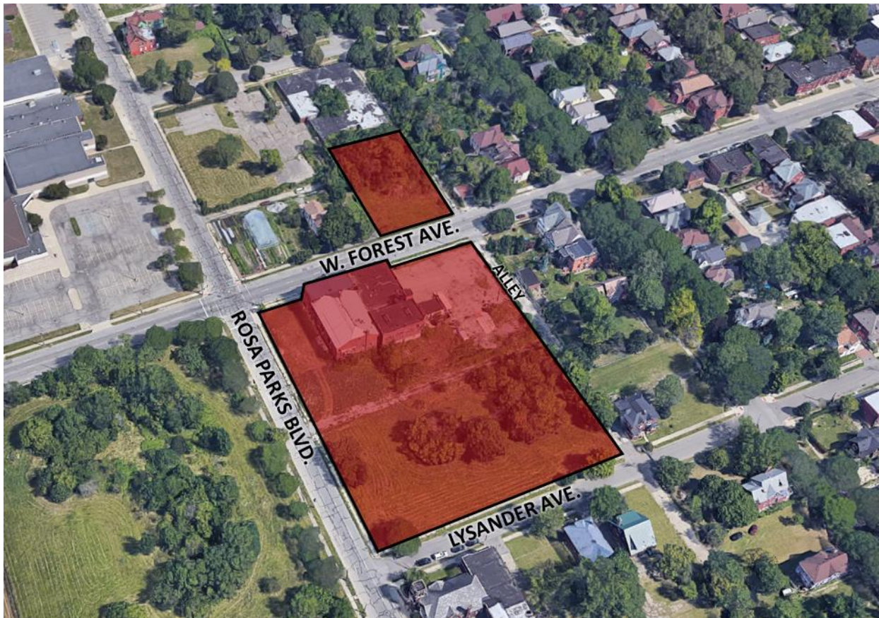
Aerial view of proposed rezoning

The site is located in City Council District 6 and measures about 3 acres. The area proposed for development is currently vacant land. The area proposed to be rezoned to maintain consistency is occupied by several vacant commercial buildings and a parking lot.