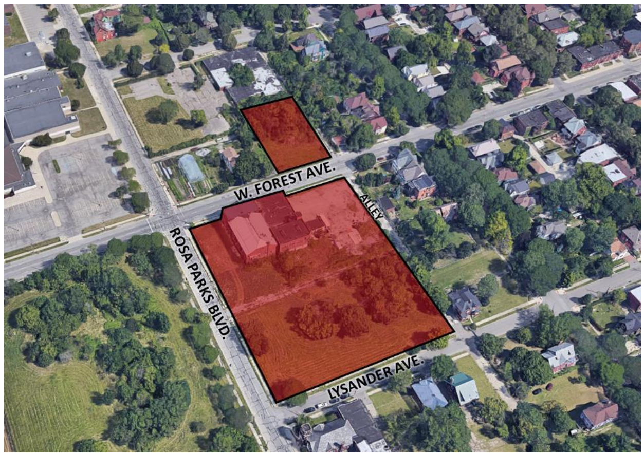
Aerial view of proposed rezoning

The site is located in City Council District 6 and measures about 3 acres. The area proposed for development is currently vacant land. The area proposed to be rezoned to maintain consistency is occupied by several vacant commercial buildings and a parking lot.