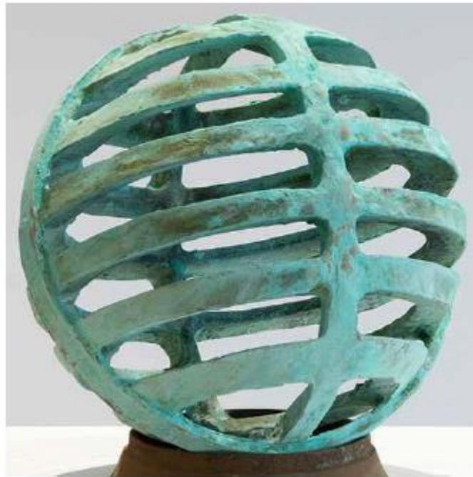
Rendering of proposed sculpture

Another exterior change being proposed is the installation of a new sculpture at the circular drop-off area near the intersection of Washington Boulevard and West Jefferson Avenue. The spherical sculpture measures six feet across and will be installed in an existing landscape bed.