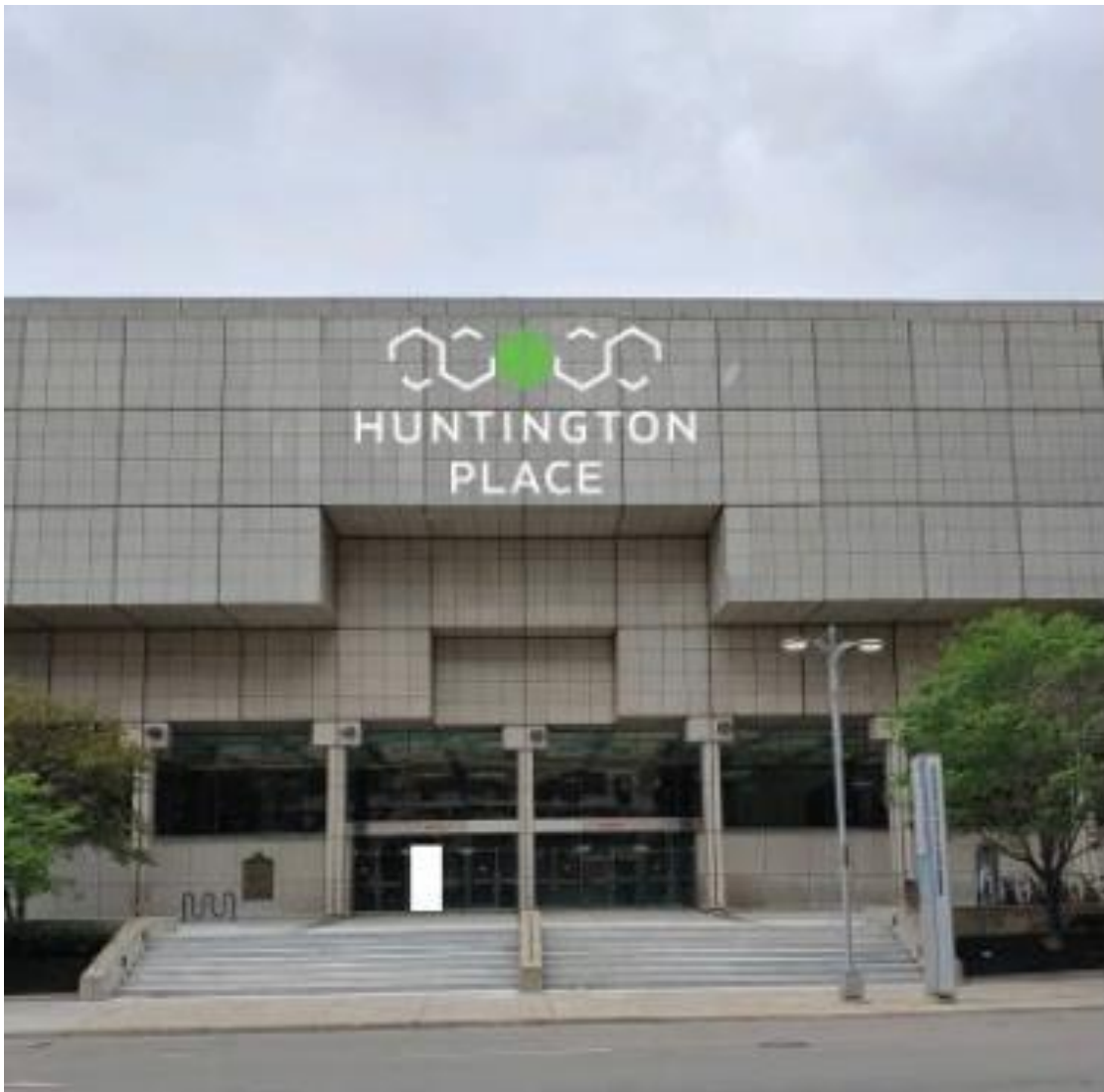
Proposed sign to be located above entrance facing Washington Boulevard (east) Three signs are proposed, one above each entrance