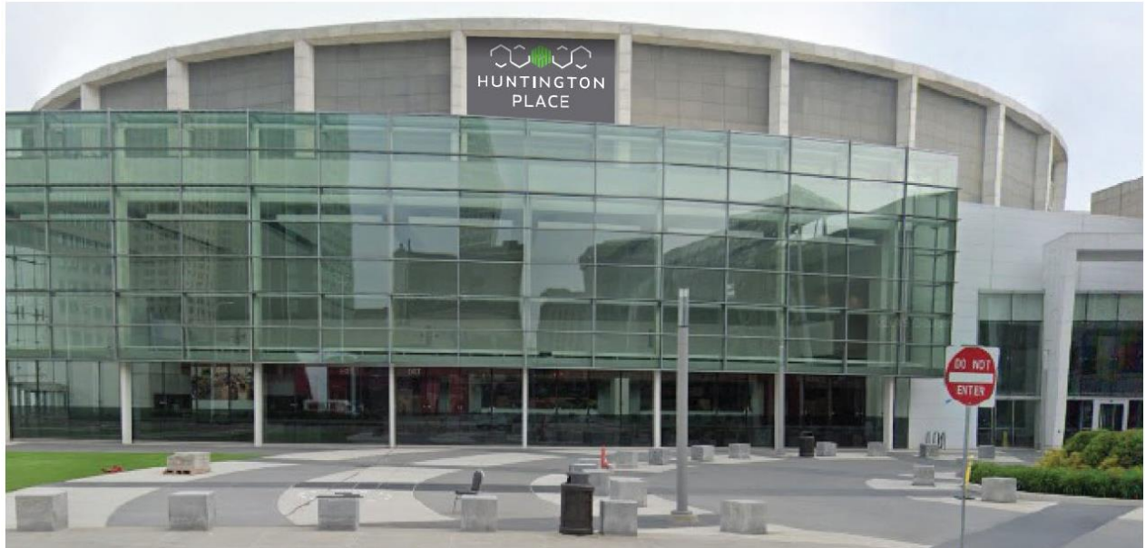
Proposed ballroom sign facing north – two other signs are proposed, facing east and south (three signs total)