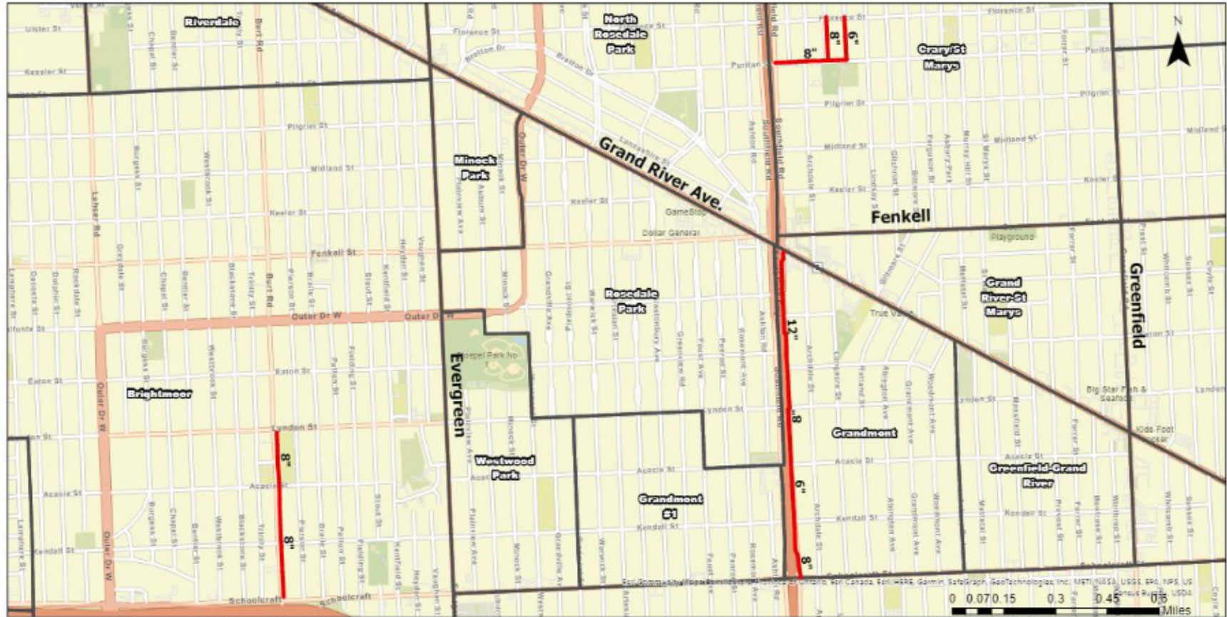
Detroit West Side - Council District 1 - Watermains on Burt, Southfield Freeway Northbound Service Drive, Puritan, Harlow, and Oakfield