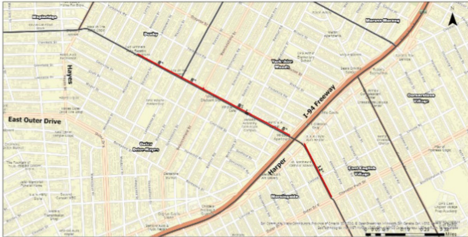
Detroit Northeast Side - Council District 4 - Watermains on Whittier