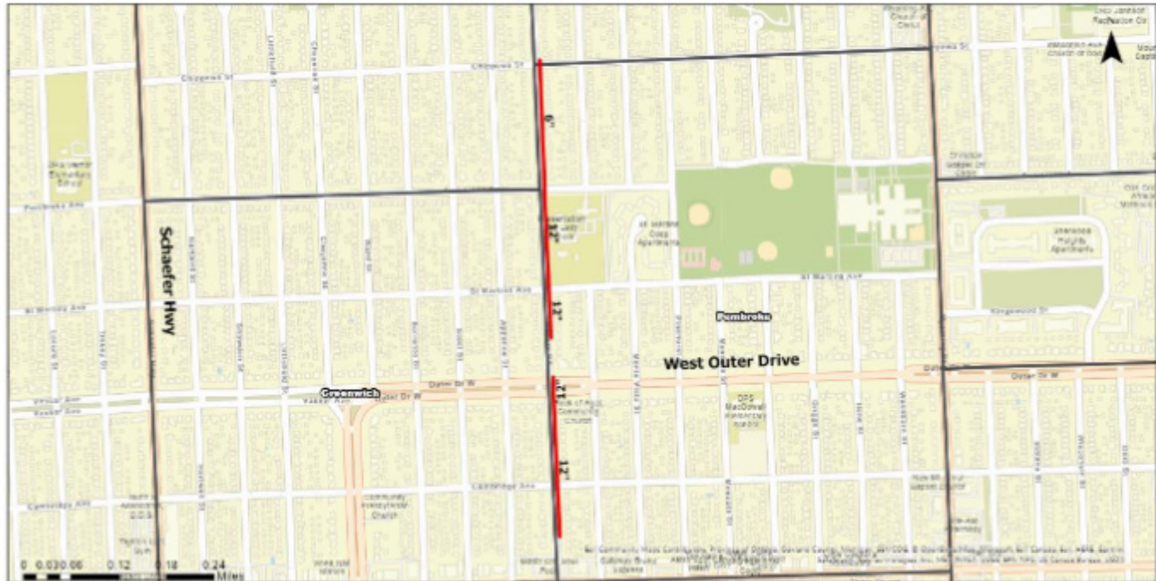
Detroit Northwest Side - Council District 2 - Watermains on Meyers Rd