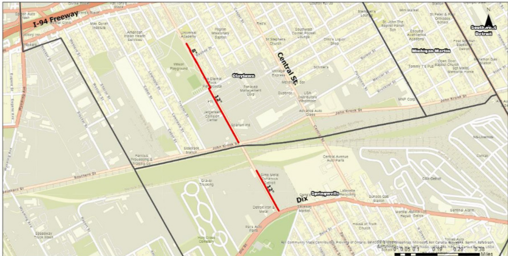
Detroit Southwest Side - Council District 6 - Watermains on John Krok