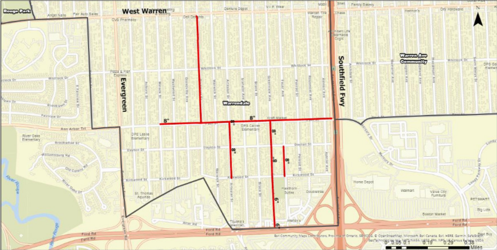
Detroit West Side - Council District 7 - Watermains on Paul, Piedmont, Artesian, Greenview, and Faust