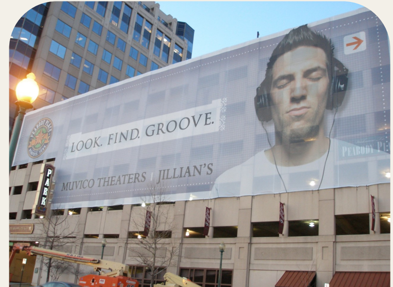
Left: The Freelon garage mesh screen installation layout Above: mesh screen example by Britten Inc.