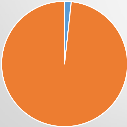
2020 YTD GMI