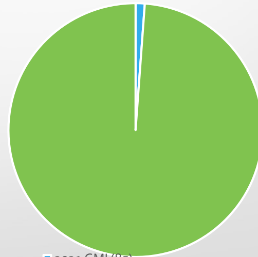
2021 YTD GMI