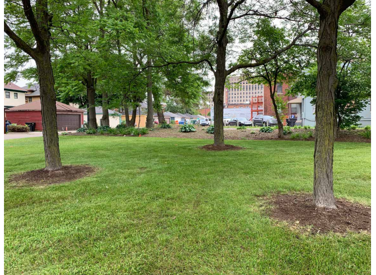
VIEW FROM WEST AT 3RD AVE SIDEWALK LOOKING EAST ACROSS SITE