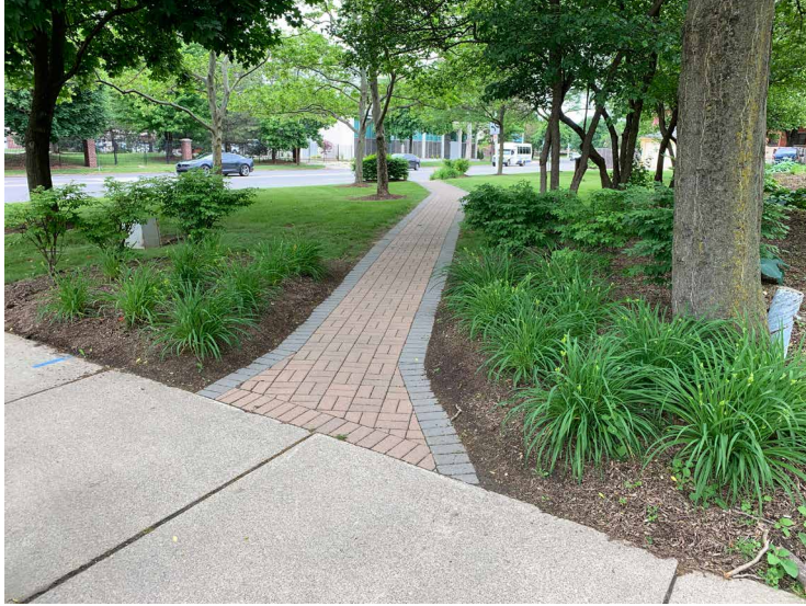
VIEW FROM SOUTHEAST CORNER LOOKING NORTHWEST ACROSS SITE - EXISTING BRICK PATH TO BE SALVAGED AND REUSED