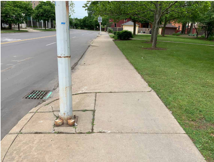
VIEW FROM NORTHEAST CORNER OF INTERSECTION AT 3RD AVE AND LOTHROP ST LOOKING NORTH UP SIDE- WALK