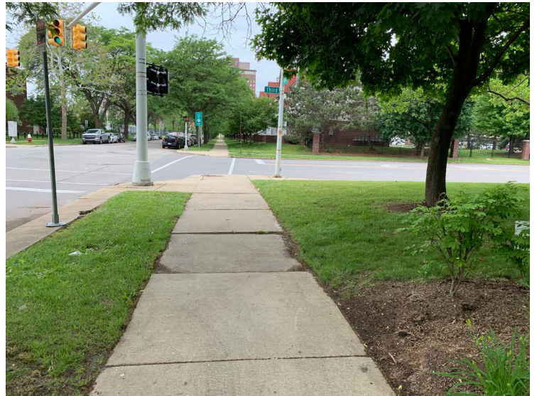
VIEW FROM NORTH SIDE OF LOTHROP ST LOOKING WEST DOWN SIDEWALK TOWARD 3RD AVE