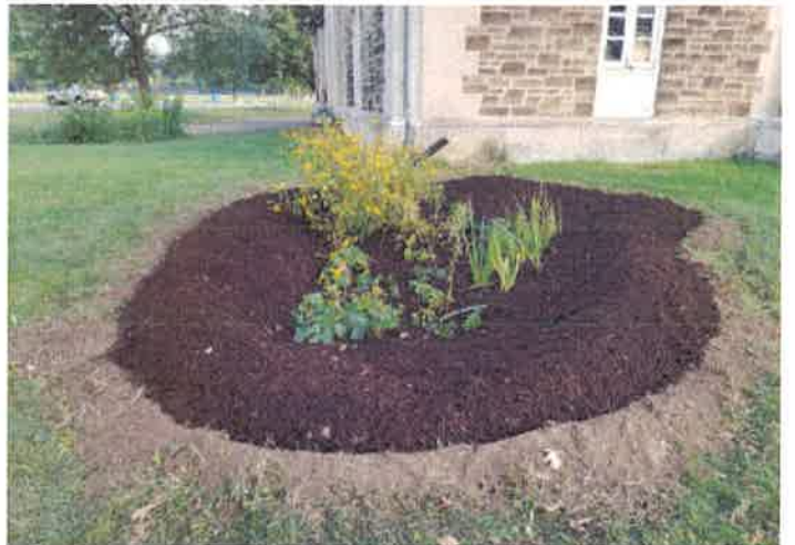
EXISTING RAIN GARDEN AT PALMER PARK NEAR WOODWARD AVE POWER BUILDING.