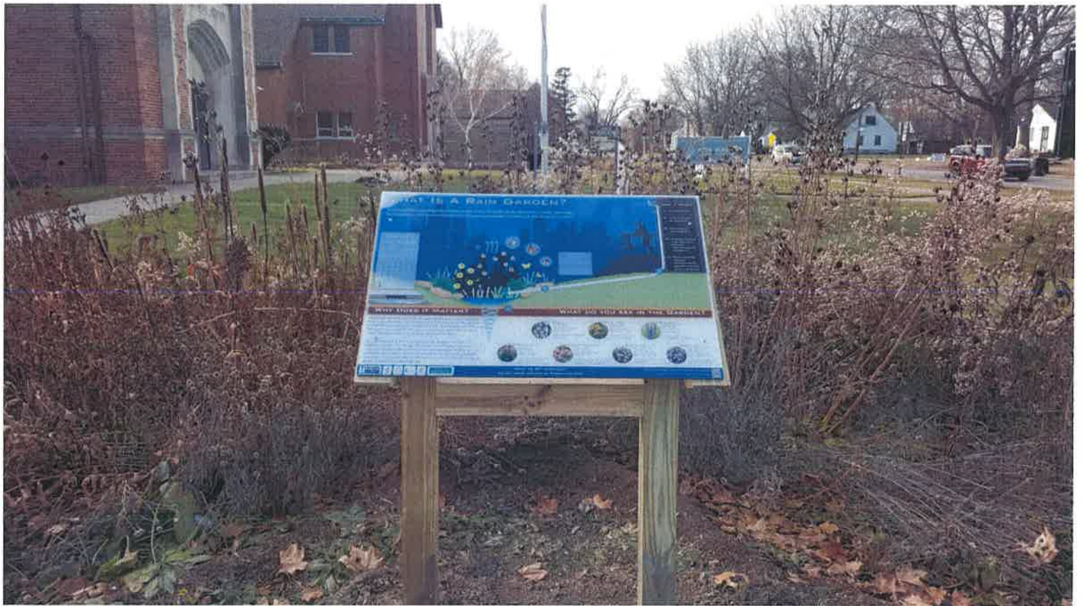
EXAMPLE OF SIGN INSTALLED AT ST. SUZANNE-