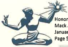
EXHIBIT A (CONT'D)