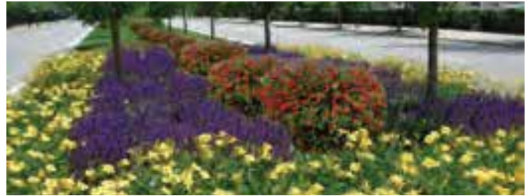
Landscaped median + trees