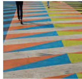
Opportunity for public art