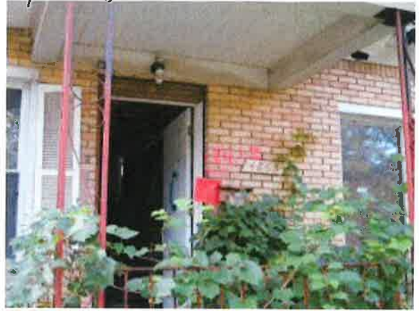
4865 Cortland A3.JPG