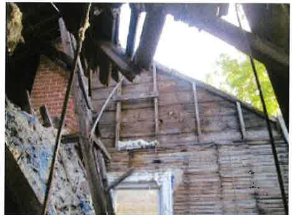
4865 Cortland Interior3.JPG