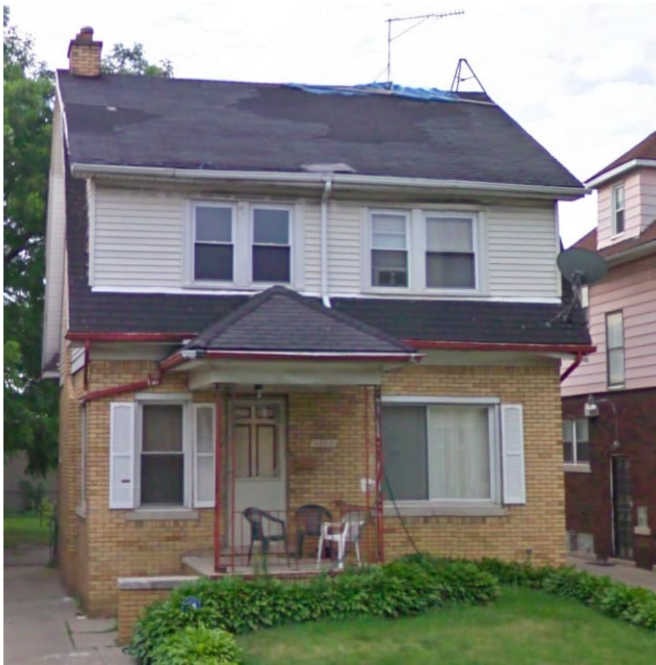
Google Earth Image, 2009