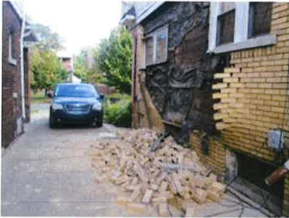
4865 Cortland B.JPG