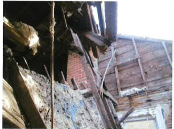
4865 Cortland Interior1.JPG