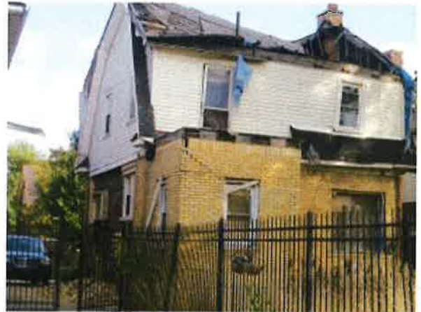
4865 Cortland BC.JPG