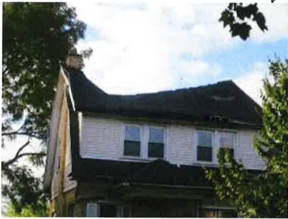
4865 Cortland A.JPG