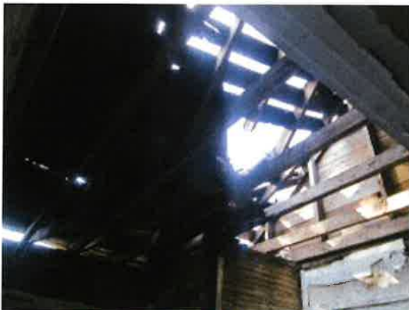
4865 Cortland Interior2.JPG