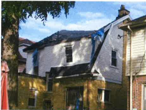
4865 Cortland CD.JPG